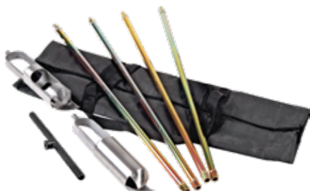
Signature Series Kit Shown

The AMS Soil Auger Kits are Complete and Compact. The stainless steel mini soil auger kit is popular for critical environmental sampling.