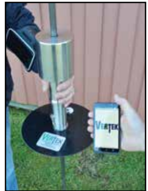
VERTEK SMART (DCP)

AMS Dual Mass Dynamic Cone Penetrometer (only) #300.00 | $1,890.05