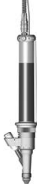
HSP / HSD