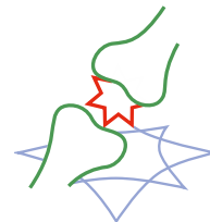
ORTHOPAEDICS/ PAIN MEDICINE/ RHEUMATOLOGY