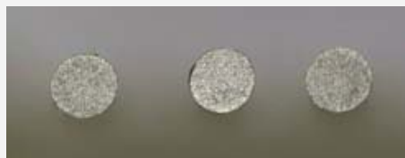
.018” head-on view of the wire bond