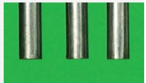
.018” side view showing well-formed sharp edges and corners