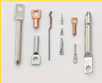
Flatten & Pierced Pins