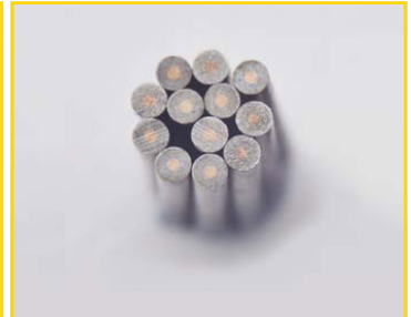
Wire Bond Pins