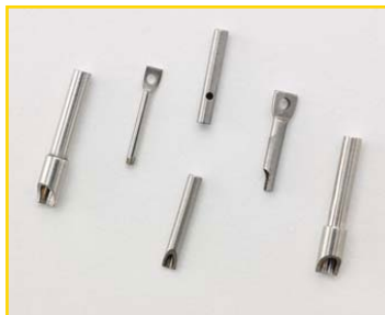
Solder Pot Pins