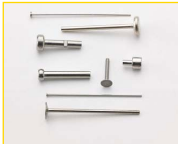
Single Head Pins