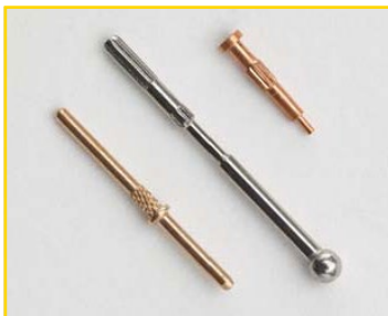
Grooved & Knurl Pins