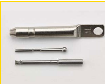
Roll Formed Undercut Pins