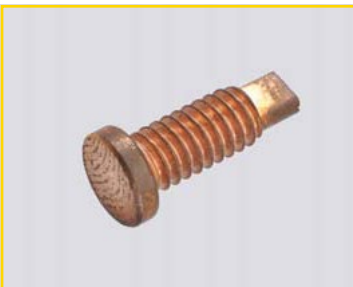
Threaded Terminal Pins