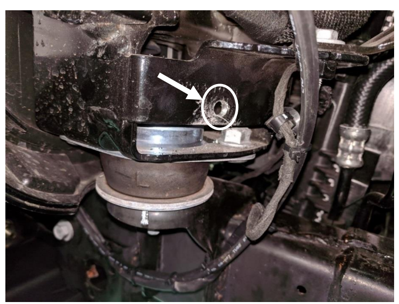
Figure 1 (Driver side shown)