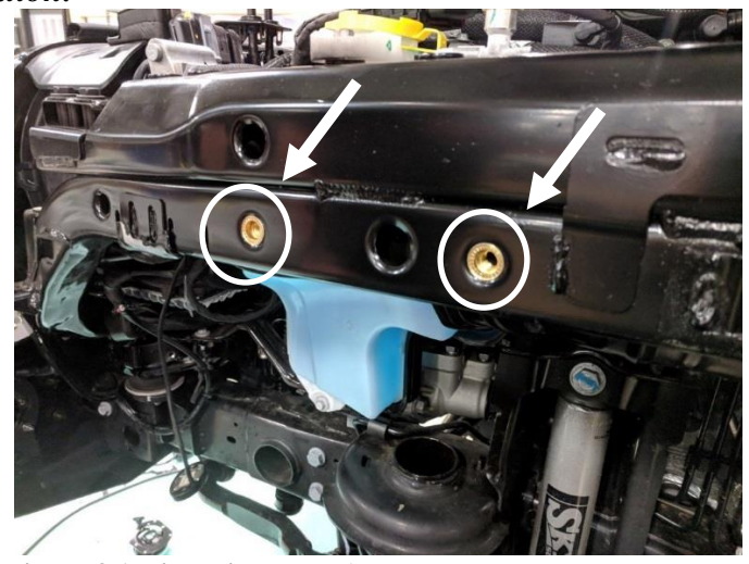
Figure 3 (Driver side shown)

NOTE: We recommend coating the knurls of the Rivnut with Loctite before installation.