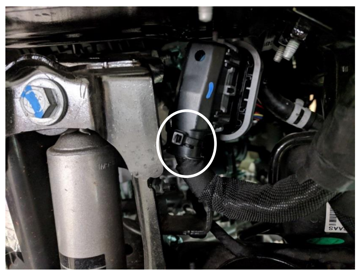
Figure 4 (Passenger side shown)