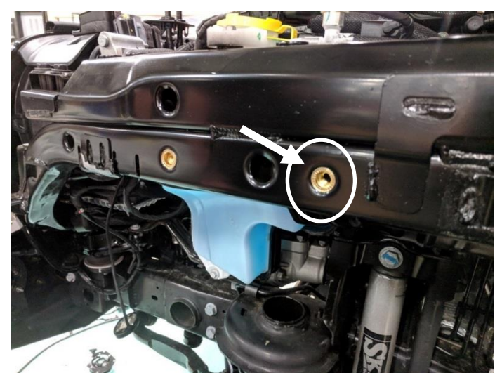
Figure 2 (Driver side shown)

5. With the expendable tool threaded into the Rivnut, insert the Rivnuts into the holes making sure they fit in far enough to flush the collar of the Rivnut to fender panel. (Figure 3)