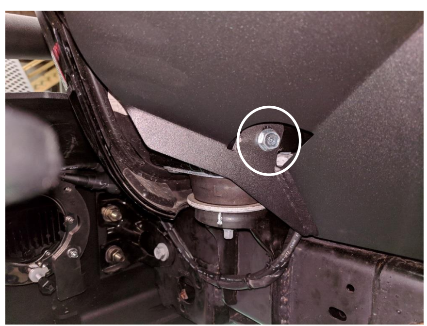
Figure 7 (Driver side shown)

11. Loosely reinstall the self-tapping bolt removed in step 2. (Figure 7)