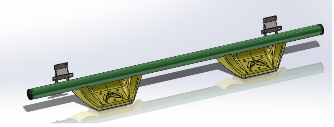
Figure 1 - DRIVER SIDE FAB FOURS SIDE STEP

1. Identify the driver side Fab Fours Side Step. The driver side Fab Fours Side Step is shown below: