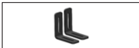
22352 Light Bar L-Bracket QTY:2