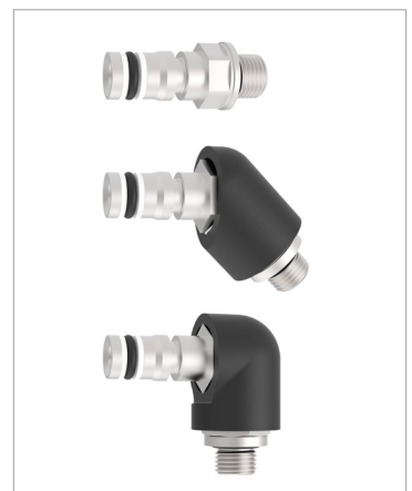
Plug-in screw connectors 0°, 45°, 90°