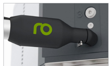
PrimeConnect plug coupling