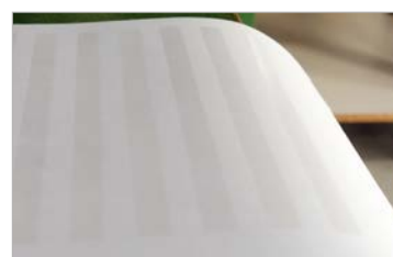
Excellent application quality