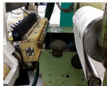
RobaCoat IT with CoolTouch insulation