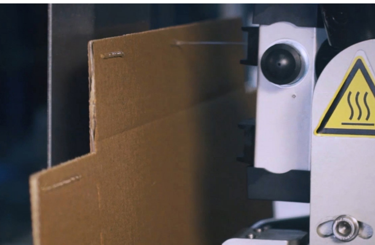
Intermittent bead application to the lid flap using SX LongLife

Since 2010, Vervo Advanced Packaging Technologies, based in Istanbul, Turkey, has focused on the automation of end-of-line packaging lines and the manufacture of wrap-around packaging machines for secondary packaging made of cardboard.