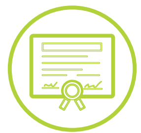
6. Data Destruction

DMD is AAA NAID Certified for onsite and offsite data destruction. DMD maintains the R2 certification for electronic waste compliance. DMD protects you for compliance across HIPAA, SOX, PCI, GLBA, FCRA, and other associated state and federal laws.