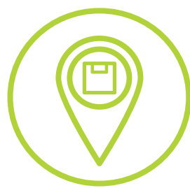
5. Receive Device