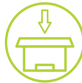
3. Package Device