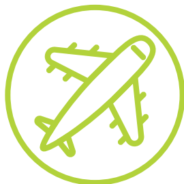
4. Ship Device