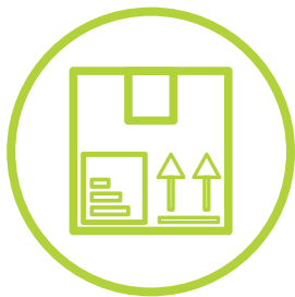
1. Pre-paid Box Sent

Added security is achieved with an optional thumb drive which contains our NIST 800-88r1 certified software that overwrites the data on the device before shipping. With this option, a thumb drive is included in the prepaid box.