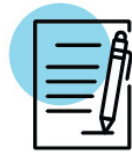
Audit & Assurance