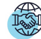
Mergers & Acquisitions