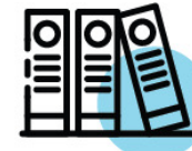
Accounting & Bookkeeping