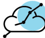
Cloud ERP (Netsuite)