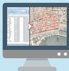
Excel - Based Spread Sheet Mapping