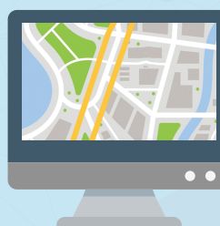
Accelerate Utility Network Implementation