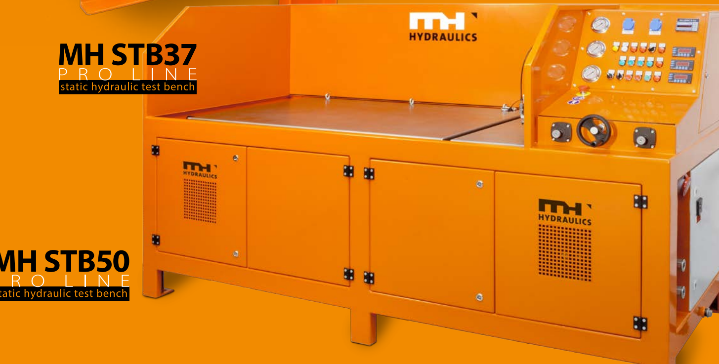
MH STB37 PRO LINE static hydraulic test bench