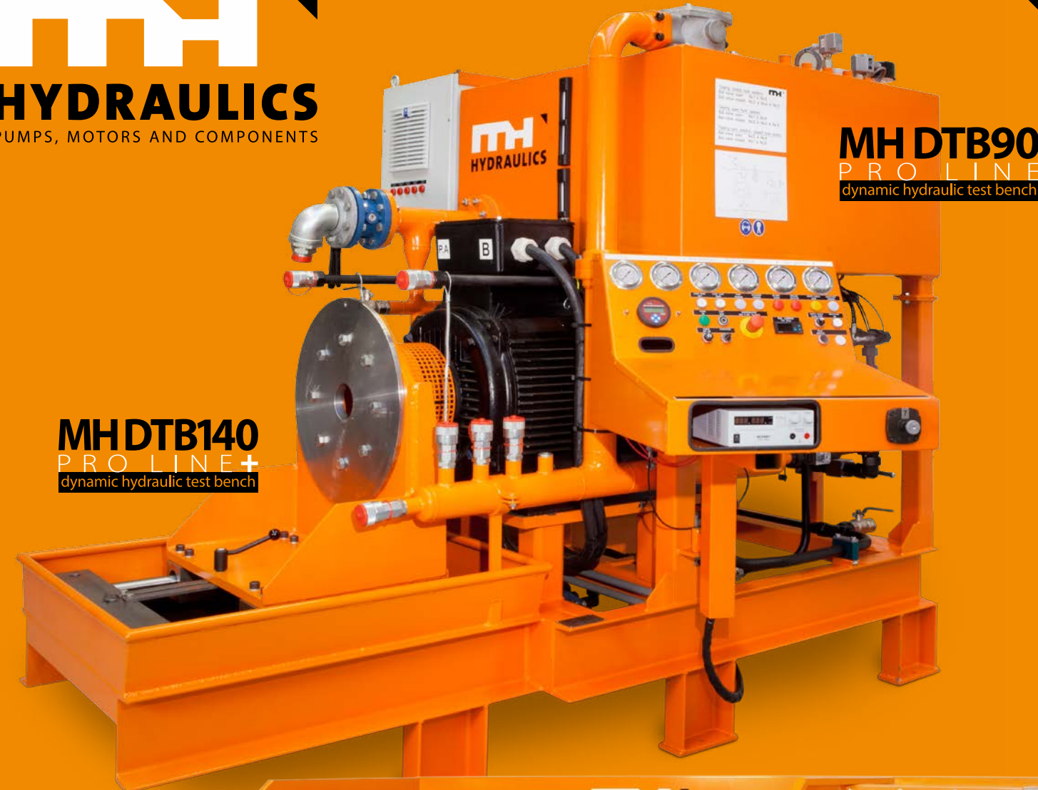
MH DTB140 PRO LINE+ dynamic hydraulic test bench

MH HYDRAULICS PUMPS, MOTORS AND COMPONENTS