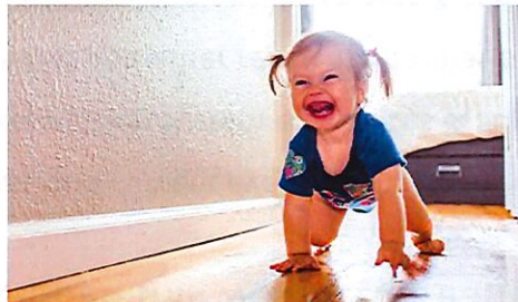
Developmental Milestones Checklists