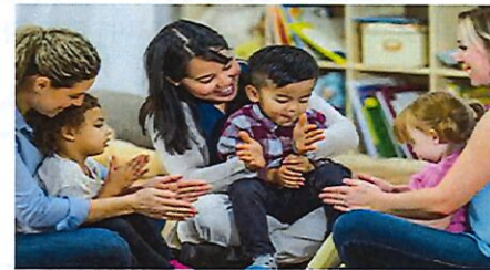
Activities in Your Area