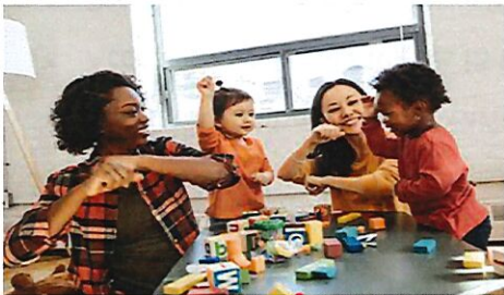
What is Social Emotional Development?