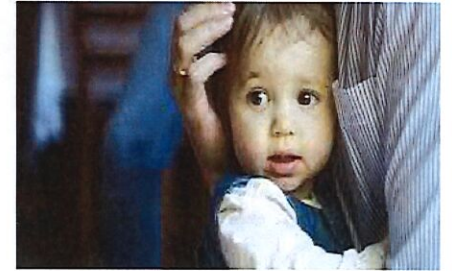
Early Development & Well-Being