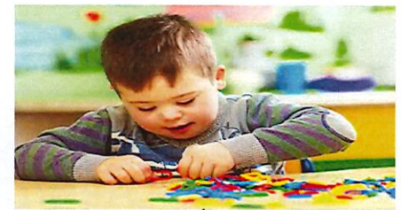
Transition to Preschool