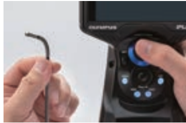
Image Capture Made Easy

The IPLEX G Lite videoscope's ergonomic design is complemented by TrueFeel articulation, making the joystick incredibly responsive. A light touch produces an immediate response and precise movement from the insertion tube so that it is easier to maneuver the scope.