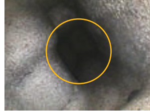
Predecessor (IPLEX UltraLite)