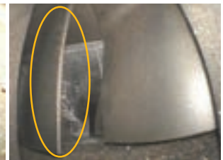
Smooth videos at 60 fps