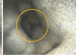
Bright illumination, even in large and deep areas