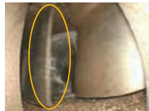
Predecessor (IPLEX UltraLite)