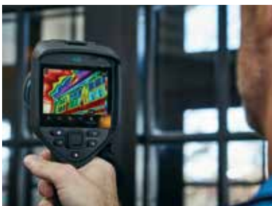
One-handed operation with convenient buttons for safe, streamlined use