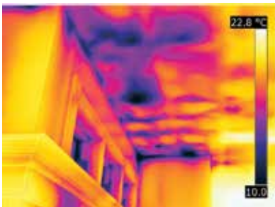
Quickly detect moisture intrusion and building deficiencies