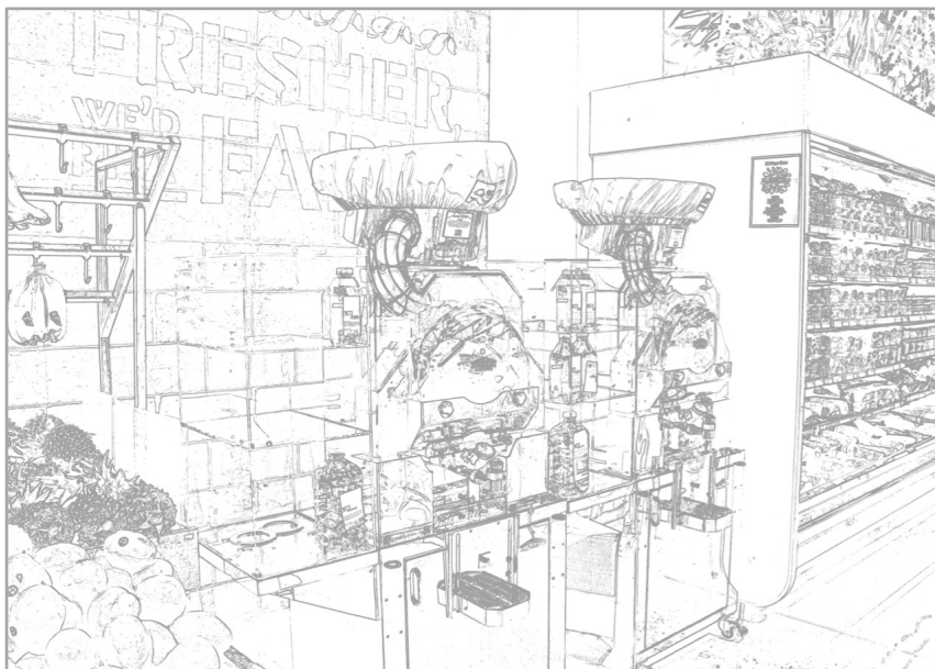
Picture: 2x CITROCASA 8000SB-ATS for Self-Service Juicing of Oranges and Grapefruit

Give your customers what they want and earn healthy profits for your shareholders. By offering in-store, self-service citrus juicing options to your customers, you're offering your clientele the ultimate fresh juice experience, guaranteed freshness, and you're offering a premium product in the most labor-efficient way.