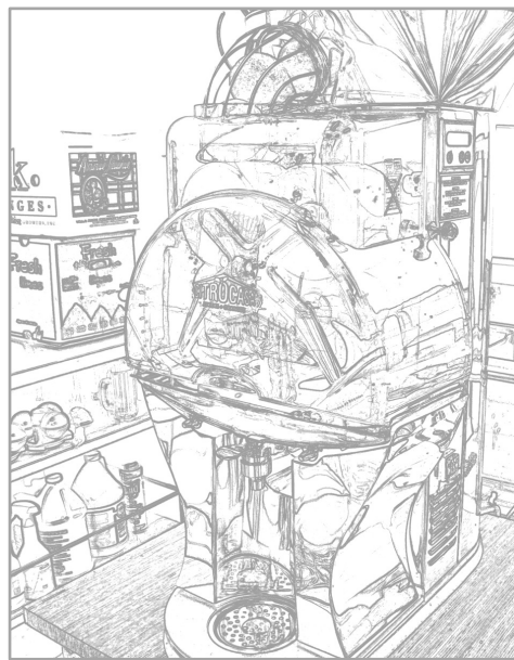
Picture: CITROCASA Fantastic F/SB-ATS