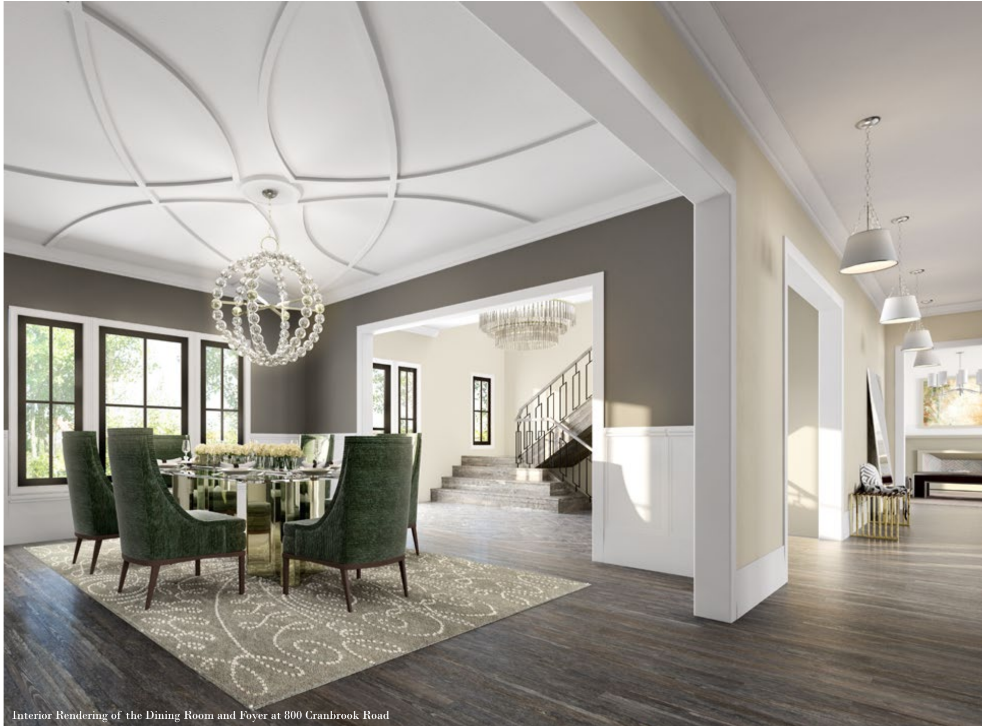
Interior Rendering of the Dining Room and Foyer at 800 Cranbrook Road

Disclaimer: All images related to 800 Cranbrook Road are artistic renderings, depicting plans that are subject to change at any point during the construction process, without prior notice. Furniture and accessories are not included in the listing price.