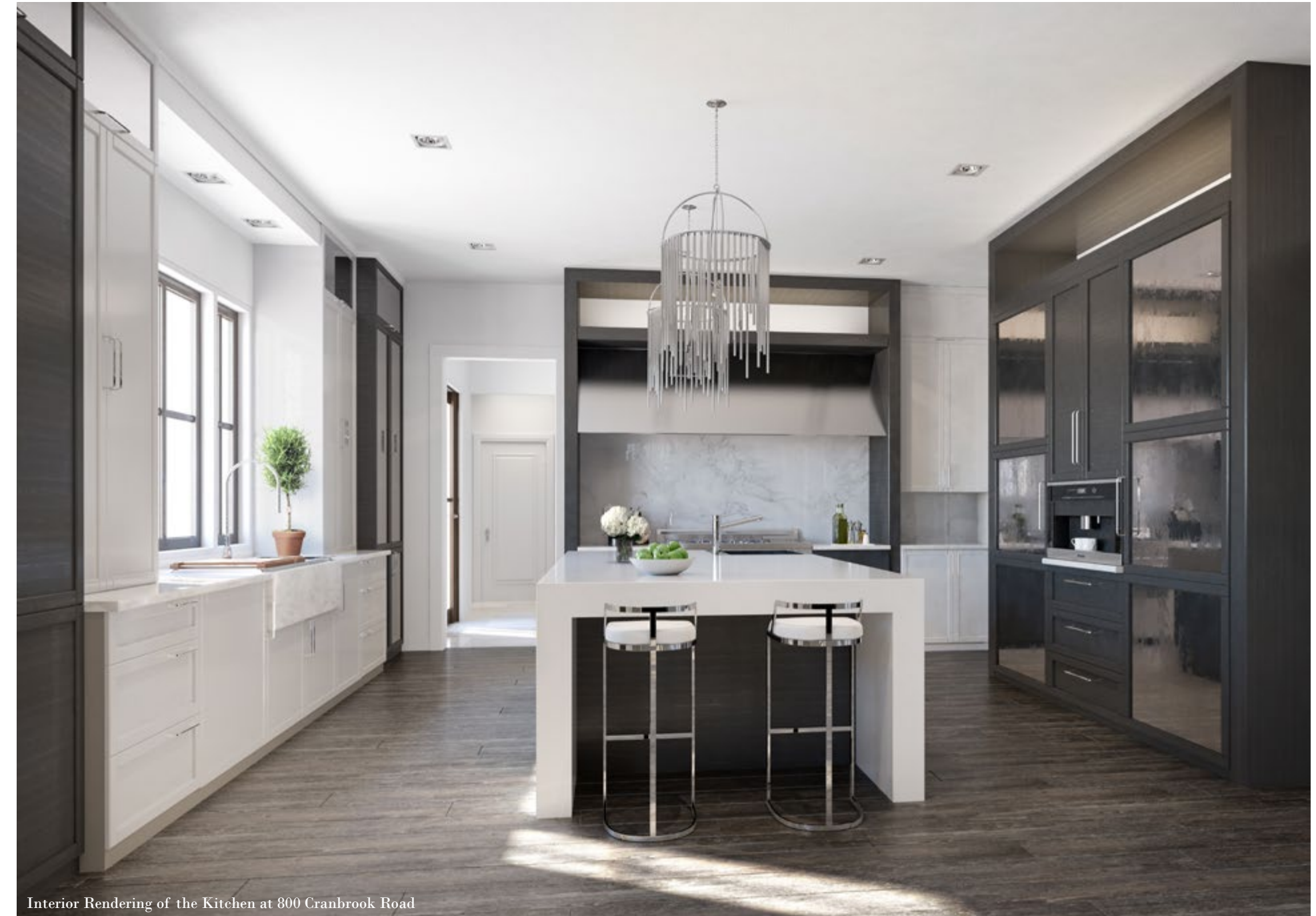
Interior Rendering of the Kitchen at 800 Cranbrook Road