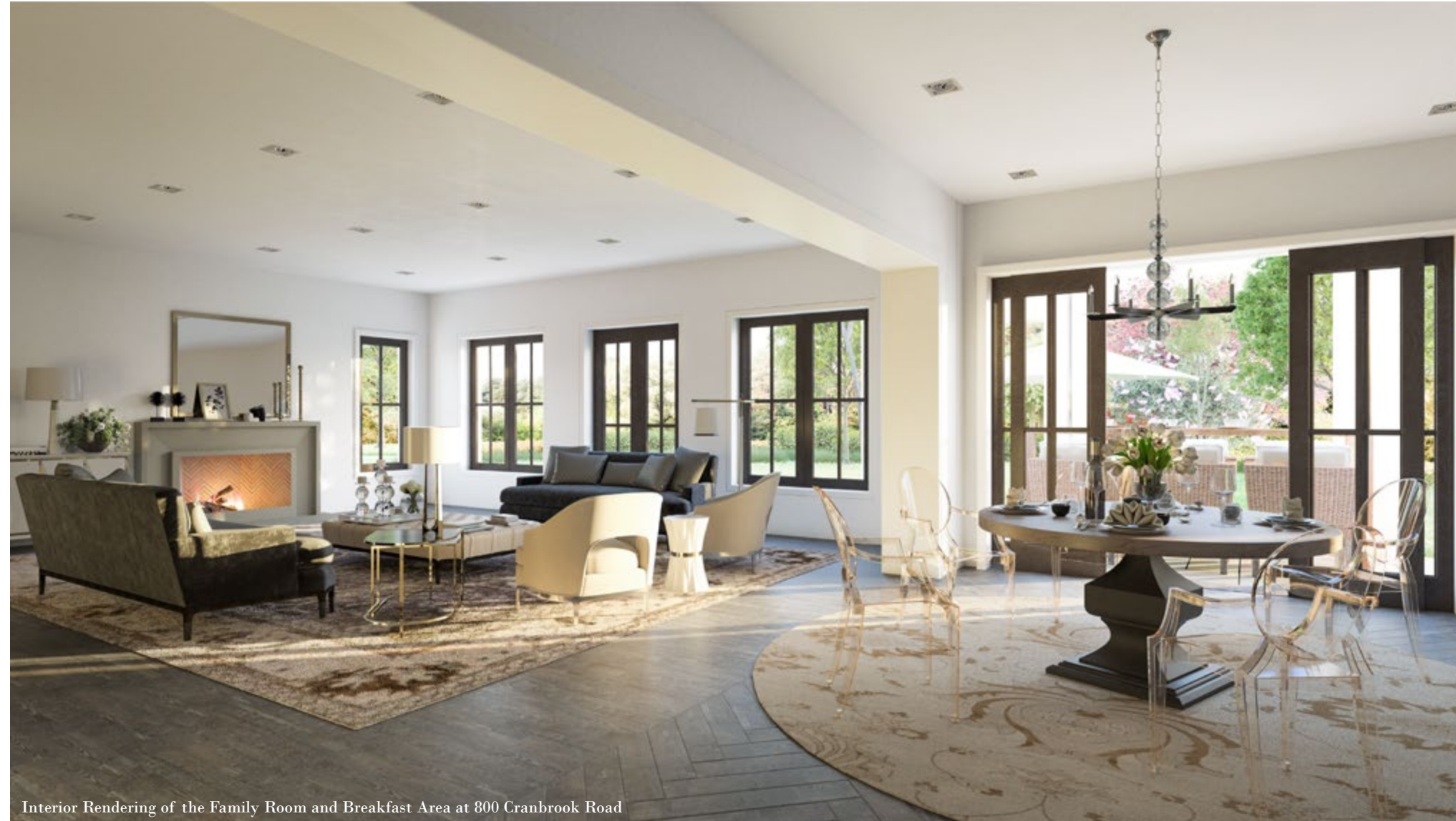
Interior Rendering of the Family Room and Breakfast Area at 800 Cranbrook Road

Architecture by Christopher J. Longe, AIA Interior Design by Ideology