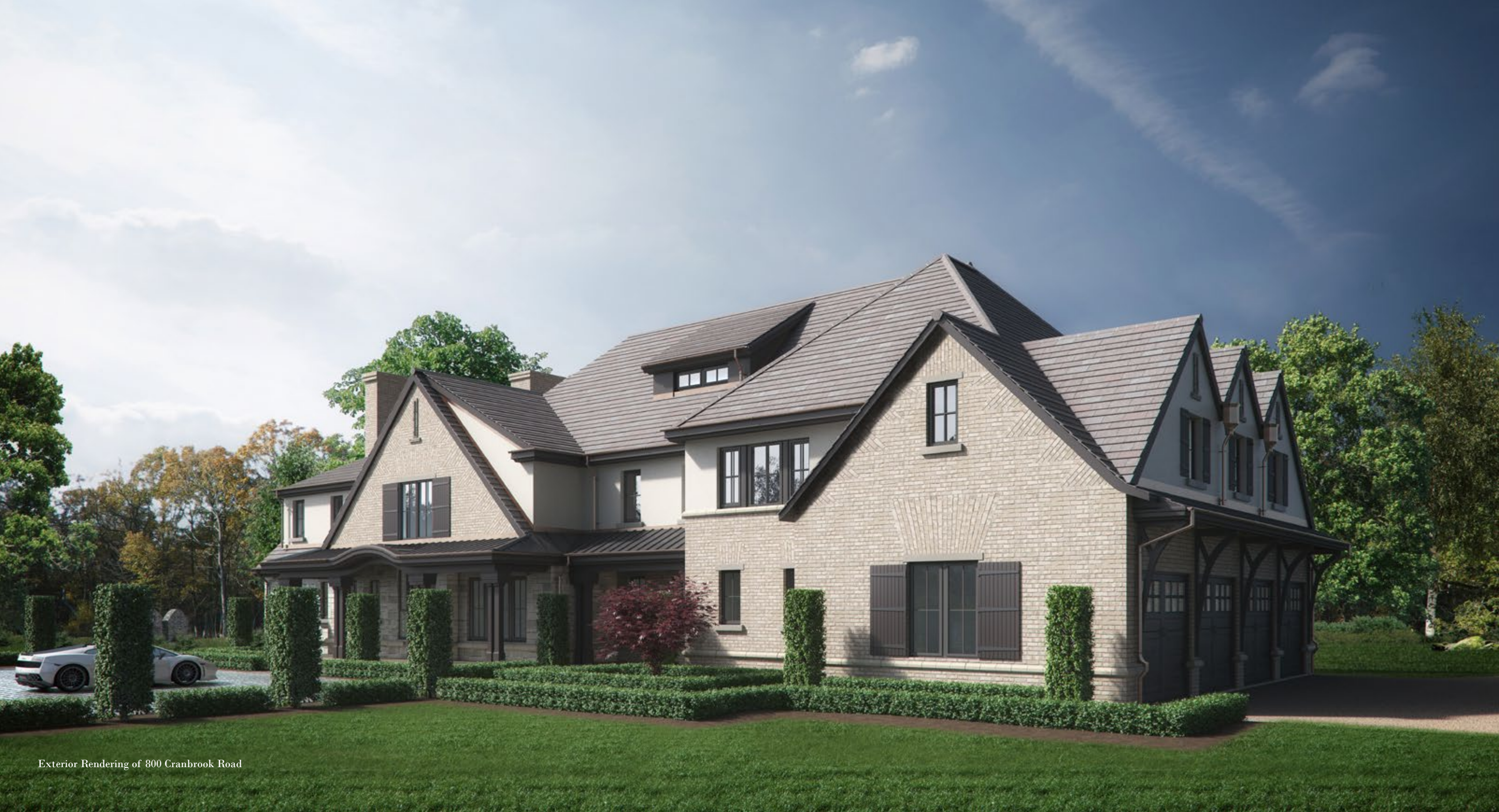
Exterior Rendering of 800 Cranbrook Road