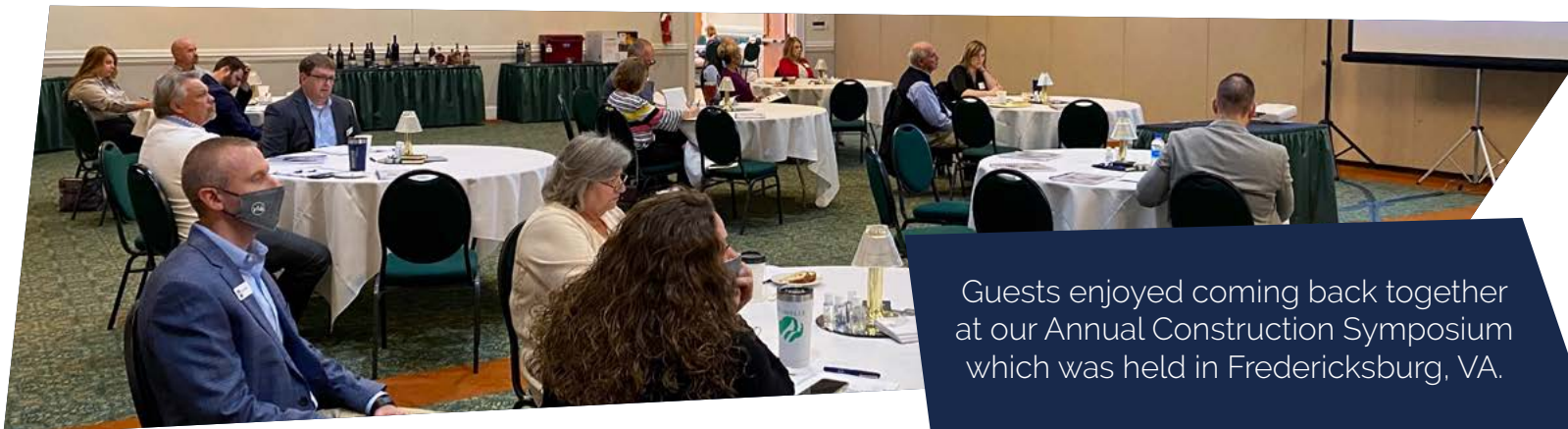
Guests enjoyed coming back together at our Annual Construction Symposium which was held in Fredericksburg, VA.