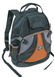
Fiber Splicer's Toolkit