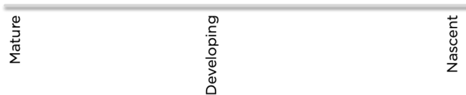
Fig. 2. Y-axis of the Knowledge-Method matching Matrix

41 The Y-axis is also a continuum that ranges roughly from Nascent condition-of-knowledge to Developing to Mature (see 42 Figure 2). When the condition of knowledge (about a specific phenomena, in a topical area, for a discipline, or for society and 43 science as a whole) is low (Nascent), the types of methods that are best used fall on the left side of the X-axis continuum. As 44 the condition of knowledge develops, the best methods move toward the right side of the X-axis.