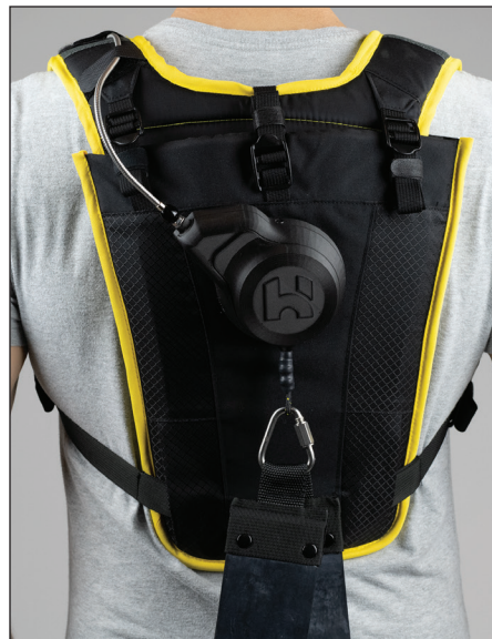
Figure 11: Shortest Back Length

Band Length and Strength Contact HeroWear to obtain the proper Band length or strength for the user.