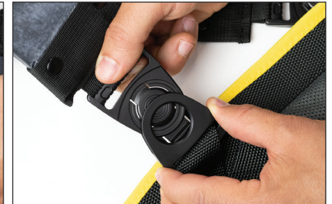
Figure 6: Clip Bands to Thigh Sleeves