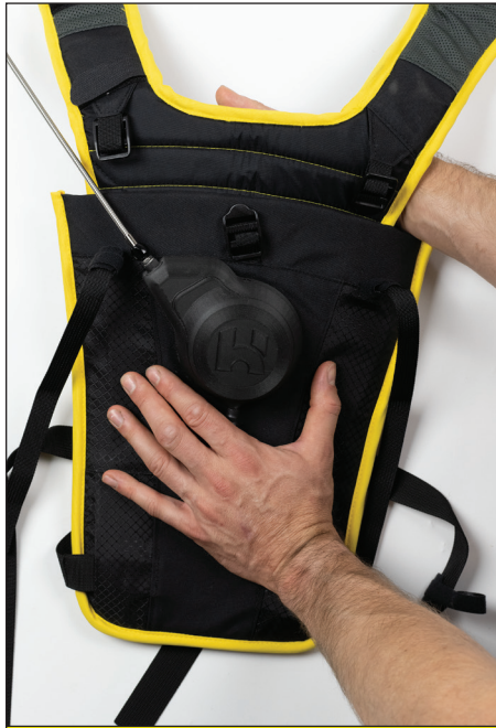
Figure 2: Shoulder Strap Installation