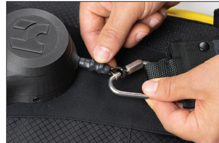
Figure 5: Connect Bands to Rope Loop