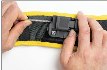
Figure 3: Switch Installation