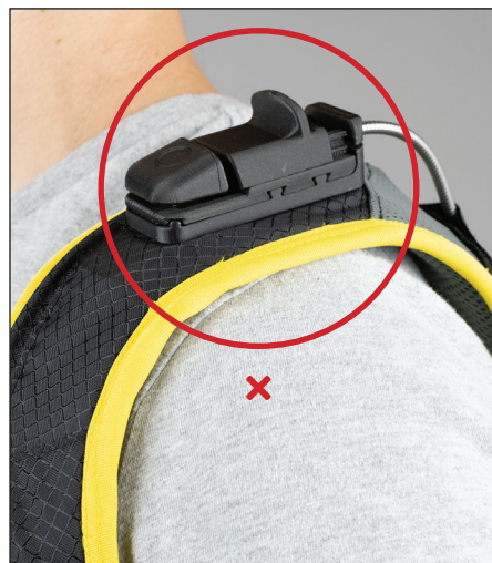
Figure 13: Male Straps Adjusted Incorrectly. Straps too loose. Note height of Switch.