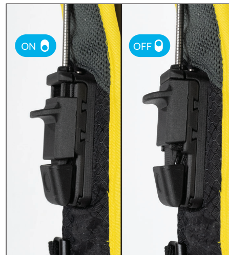
Figure 8: Dual-mode Switch ON/OFF

Step 4 Connect Bands . If the Back and Thigh Sleeves are already connected with the Bands, the user is ready to use the Apex exosuit; if not, connect the Bands by clipping them (Figure 9).