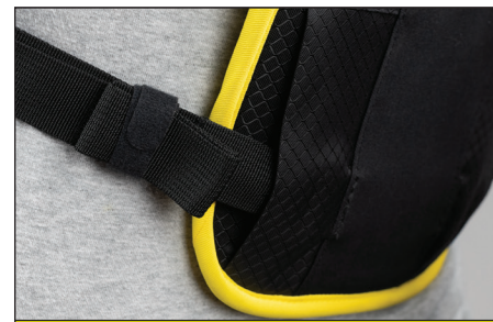
Figure 7: Capture Loose Webbing with Webbing Keepers