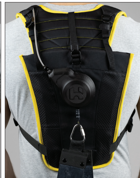
Figure 12: Longest Back Length