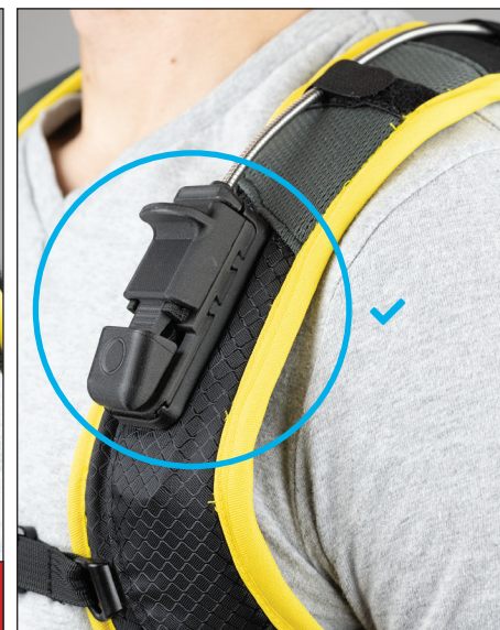
Figure 14: Male Straps Adjusted Correctly