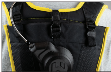
Figure 4: Webbing Strips into Ladder Locks