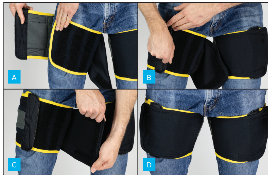
Figure 10: Wrapping Thigh Sleeve