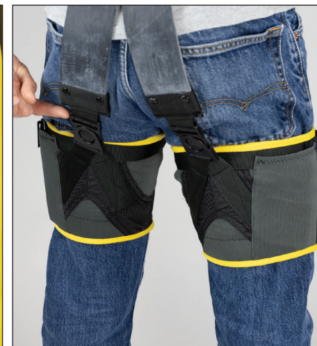
Figure 9: Thigh Sleeve Placement