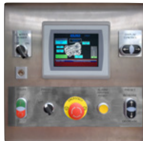
HMI control panel