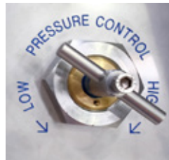
Adjustable pressure control