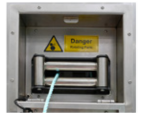
Winch mounted inside unit