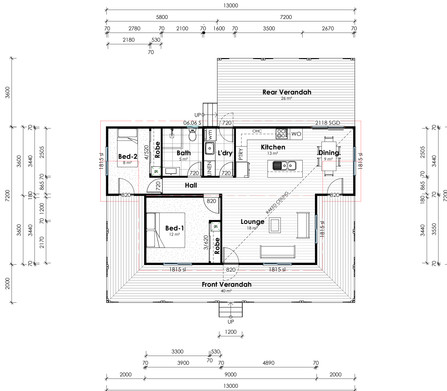
Plan Floor Plan 1 : 100