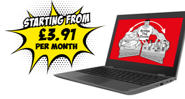
LENOVO WINBOOK 100e

Pay monthly from £4.72 per device per month over 3 years or £6.72 per device per month including 3 Year Advanced Repair Service.