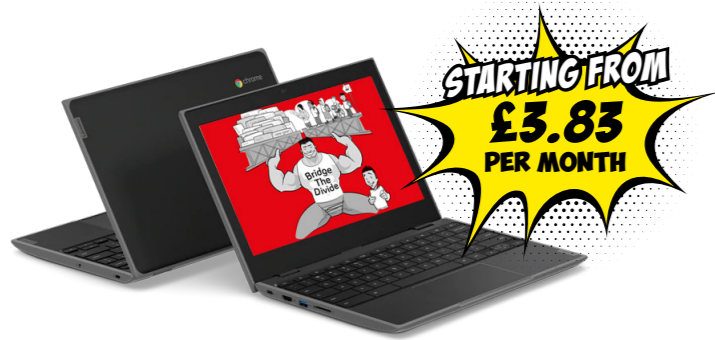
LENOVO CHROMEBOOK 100e