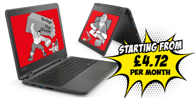
LENOVO CHROMEBOOK 300e

Pay monthly from £3.83 per device per month over 3 years or £5.45 per device per month including 3 Year Advanced Repair Service.