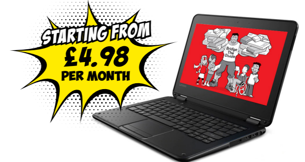
LENOVO WINBOOK 300e

Pay monthly from £3.91 per device per month over 3 years or £5.56 per device per month including 3 Year Advanced Repair Service.