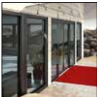
Thermally Broken Doors