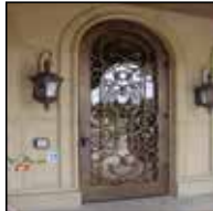
In the Floor Swingers