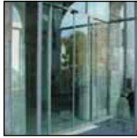
In the Floor Sliders