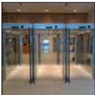
Exit Lane Breach Control