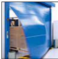
High Speed Roll-Up Doors