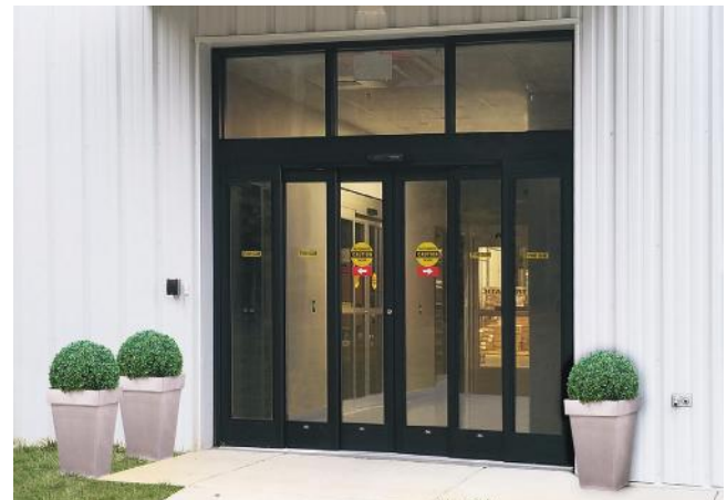
DS20 telescopic in dark bronze

Technical data subject to change without notice.