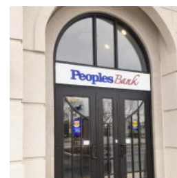
Curved Framing and Muntins