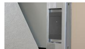
Proximity Card Reader