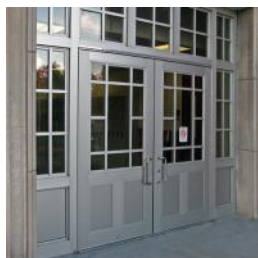
Custom Panels and Muntins