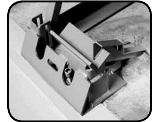
Front SafeTFrame™ Pedestal