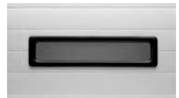
24" X 6" DOUBLE INSULATED ACRYLIC WINDOWS WITH BLACK FRAME