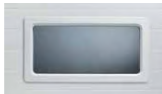
24" X 12" INSULATED GLASS Available with either a black or white frame.