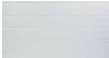
RIBBED PANEL WITH STUCCO EMBOSMENT