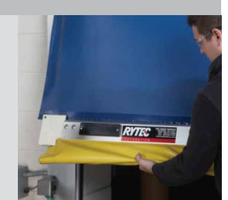
Quick-Set tabs for damage free release