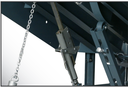
Unique hold-down assembly allows for full float and automatic release capability with air ride trailers.