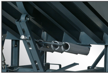
One point adjustable main spring assembly with roller and cam construction.