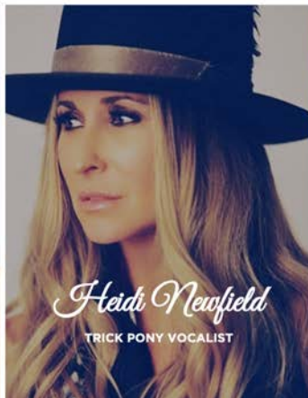
Heidi Newfield TRICK PONY VOCALIST