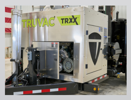
Easy access to service panel