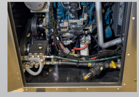
Easy access to maintenance items