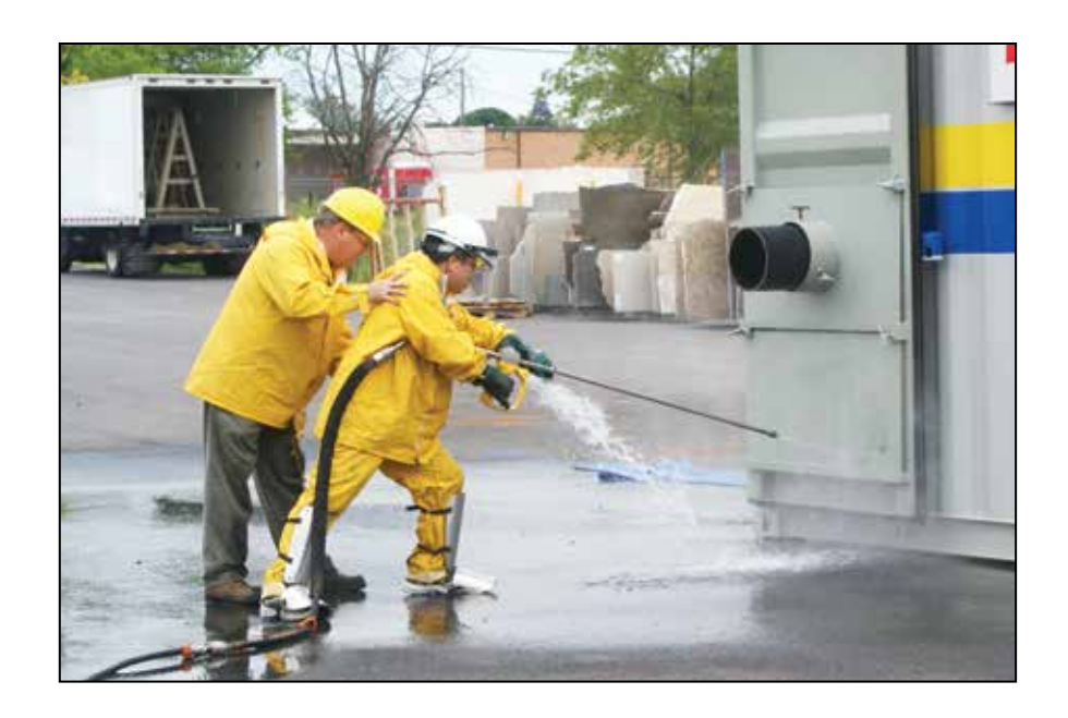
Safety • Skills • Proper Operation • Maintenance & Trouble Shooting