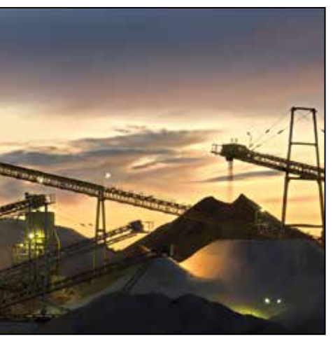
Is Your Workplace Safe & Efficient?