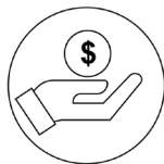
Payday Lending Agent