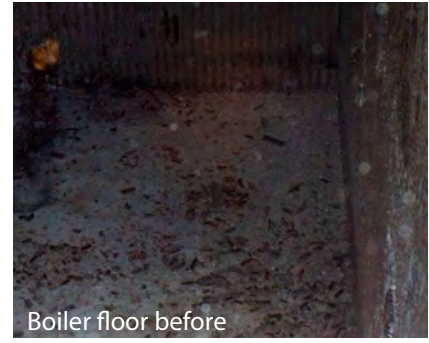
Boiler floor before

Thompson's safety performance measures and benchmarks are among the industry's most stringent. From operations to field performance, we have a strong reputation in the industry for positive safety performance and have for more than 29 years. Our safety-first culture is supported by zero-tolerance attitude for unsafe practices in the workplace, reinforced by an average of over 3,000 unannounced field safety observations.