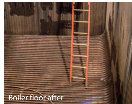
Boiler floor after