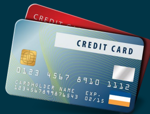
Credit card bills