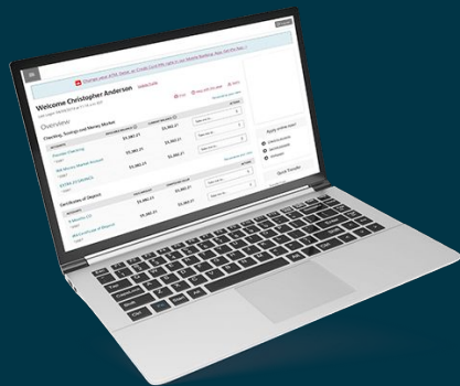
Digital bank statements