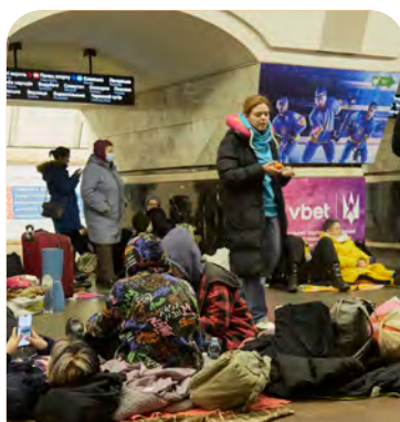
People taking shelter in a Kyiv subway station

Russian troops have attacked Ukraine from the north, east and south, including several attempts to enter Ukraine's capital, Kyiv. Russian forces control some sections inside Ukraine's borders, but Ukrainian troops have put up a tough fight and stopped Russia's first attempts to take over Kyiv. However, lines of Russian tanks several miles long have been seen headed towards Kyiv. Russian missiles have hit lots of civilian areas in Kyiv and other cities, including Kharkiv, the second-largest city. On Sunday, human rights organisation Amnesty International said that Russian weapons had hit at least four schools, killing several people and a child. The head of Amnesty, Agnès Callamard, said it was "stomach turning" and "should be investigated as a war crime". Many civilians have been hiding in subway stations and bomb shelters to avoid Russian airstrikes.