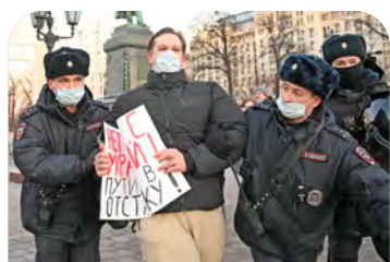
A man is led away by police officers in Moscow, Russia, for protesting against the war

Although Russia's military is much bigger and has better equipment, Ukrainian troops are fiercely defending their country. They are also being helped by many civilians who have bought weapons and taken shooting lessons in recent months. Some Ukrainian businesses have even stopped producing goods so that they can make weapons instead.