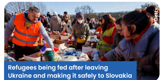
Refugees being fed after leaving Ukraine and making it safely to Slovakia

By Monday, more than half a million people had already fled Ukraine. Most have crossed into Poland, Hungary, Romania and Moldova. Organisations like UNICEF and the Red Cross have set up camps where people can shelter, warm up and get food. Countries around the world are taking Ukrainian people in, and many people who aren't from Ukraine, such as students who are studying there, are being helped to get back to their own countries.