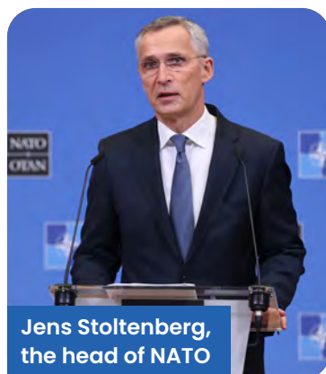
Jens Stoltenberg, the head of NATO

Russia says it wants to know that Ukraine won't join NATO (the North Atlantic Treaty Organisation). NATO is an international organisation that guarantees the freedom of its member countries. Russian president Vladimir Putin thinks that, if Ukraine joins, it will give the USA and its allies too much power right next to the Russian border. Russia has also demanded NATO removes all troops from Bulgaria and Romania.