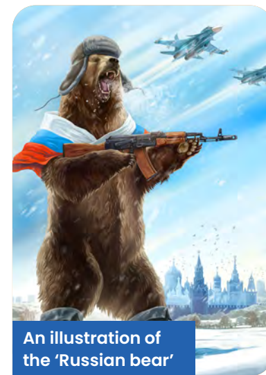
An illustration of the 'Russian bear'

Russia as a country has often been nicknamed the 'Russian bear', but Ukraine also has a bear on its side – Paddington! Ukraine's president, Volodymyr Zelensky, used to be an actor and comedian – and provided the voice for Paddington in the Ukrainian versions of the two hit movies.