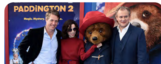
Children's charity UNICEF says Paddington's kindness makes him a perfect champion for them

Mr Zelensky became famous for starring in a TV show called Servant of the People , where he played a teacher who became president after ranting about the state of politics. He also competed in the Ukrainian version of Strictly back in 2006!