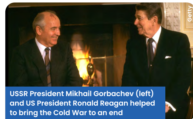
USSR President Mikhail Gorbachev (left) and US President Ronald Reagan helped to bring the Cold War to an end

The decision to allow former Soviet states to join NATO also upset Russia because, back in 1990 and 1991, many Western leaders told the Russians they would not look to grow NATO eastward.