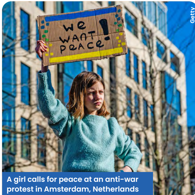
A girl calls for peace at an anti-war protest in Amsterdam, Netherlands

many people's minds right now. World leaders are being joined by business leaders to make it harder for Russia to make money (see p3). Sport is also helping to increase the pressure on Russia from all angles. Russian athletes are being banned from many international events, including the Champions League and the qualifiers for this year's men's football World Cup, which is the most-watched sporting event in the world. Sport, especially football, is big business and has huge influence around the world, so it all helps to pile pressure on Russia.