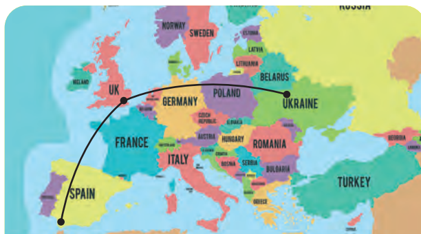
Kyiv is 1,500 miles (2,414km) from London, about the same distance from the UK to the south of Spain, so it's really far away

Getting reliable news is limited in Russia, as the government runs much of the media and has closed down many independent news organisations. But even this hasn't stopped many people in Russia from protesting against the war. Protests have taken place in more than 50 Russian cities and towns, with police arresting hundreds of protesters.