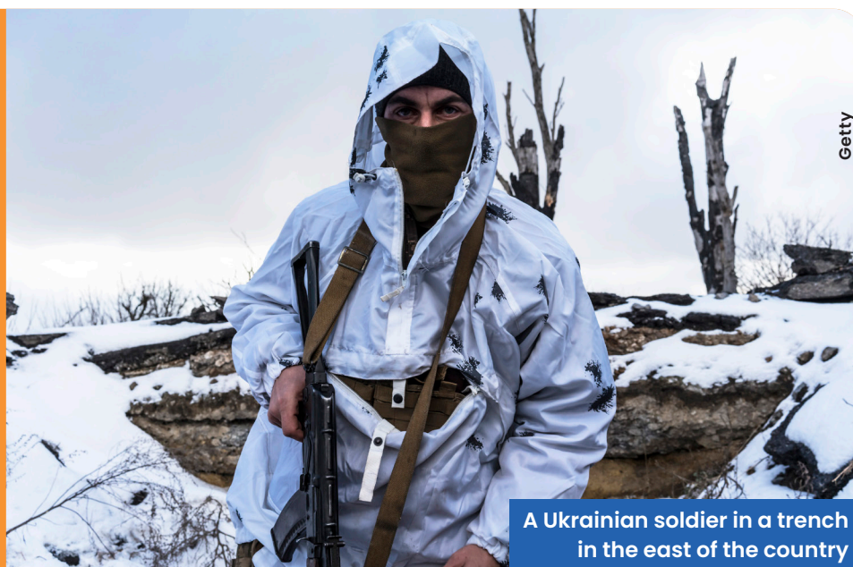
A Ukrainian soldier in a trench in the east of the country

RUSSIA has invaded Ukraine and started a war. Why did they do that and what's going on?