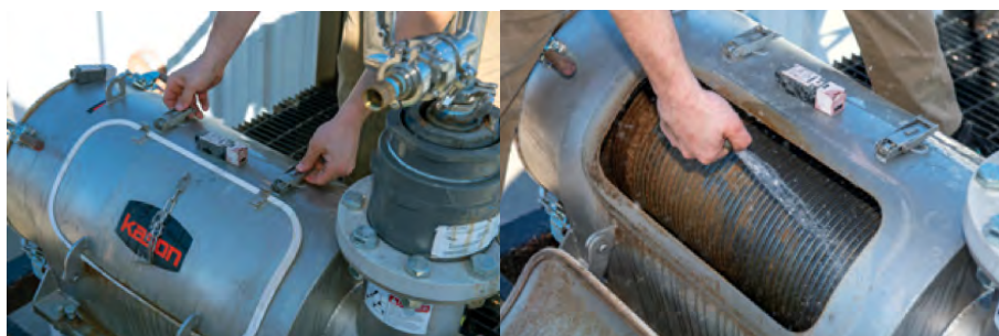
The sifter cleans easily as the front access door (left) opens for internal components to slide from a cantilevered shaft. The top access port permits quick rinse of the screen.