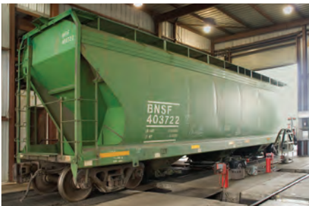
SBS Sparta receives dry-bulk granular sugars in covered hopper railcars.