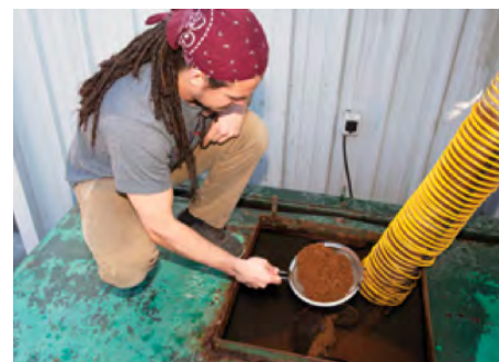
Dewatered grain (stillage) having approximately 80% moisture content is utilized for animal feed.