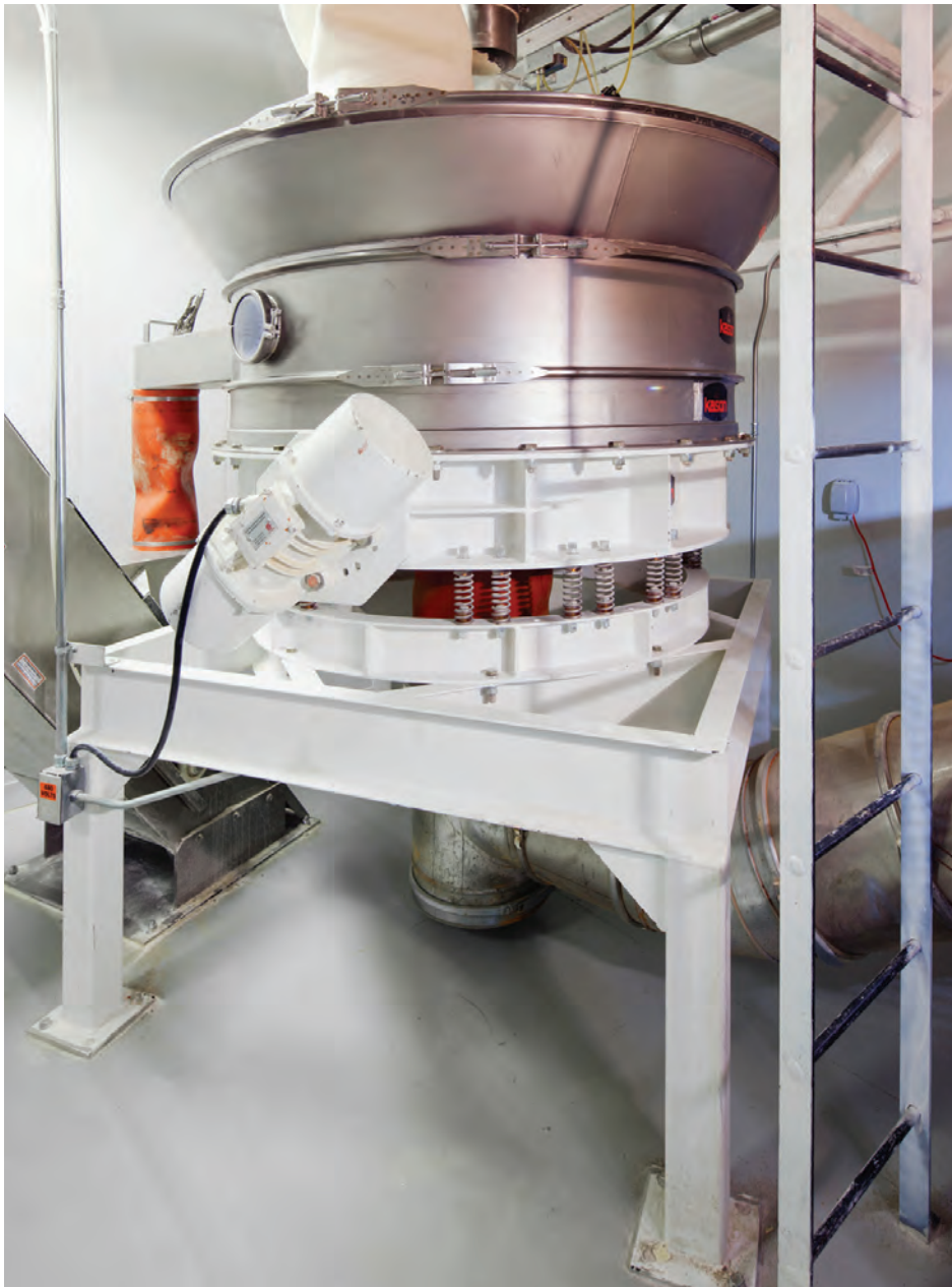
The circular fluid bed processor consumes significantly less floor space than the rectangular fluid bed dryer originally considered.