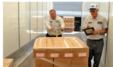
Dried pasta and other food products are shipped worldwide for hunger relief.

The Church of Jesus Christ of Latter Day Saints seeks to abate suffering everywhere, among any people. Relief efforts include feeding the hungry worldwide, and the operation of its own food production and processing plants has enabled the Church to expand emergency response for famine victims and disasters such as the tsunami in Southeast Asia and Hurricanes Katrina and Rita on the U.S. Gulf Coast.