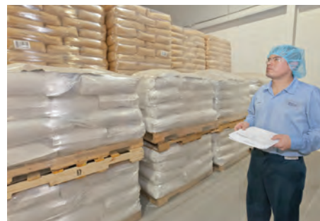
Bags of dried, screened powders are ready to be shipped to customers.

A campaign can be as short as one shift or as long as one week. Between campaigns, operators clean all the spray-drying equipment, including the screeners, with hot water, followed by a cleaning agent, and then a sanitizing agent. As a result, the screeners routinely pass Hazard Analysis & Critical Control Points (HACCP) inspection.