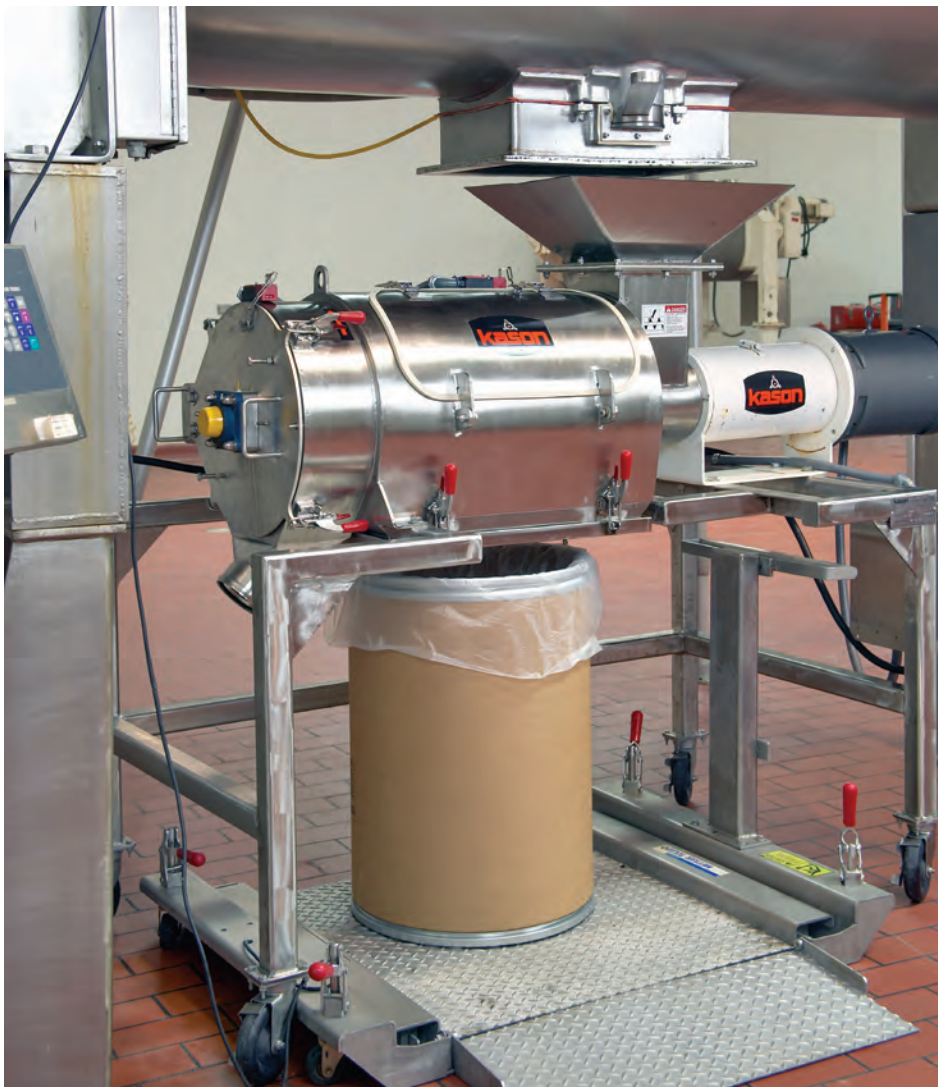
The Quick-Clean CENTRI-SIFTER screener gravity-discharges into 100-lb (45-kg) capacity fiber drums, and can be rolled to a cleaning station and other blenders.

paddle assembly and screen cylinder to be slid off of the shaft for cleaning or screen changes. During operation, the shaft rides on both shaft-end bearings, with no dependence on the inboard bearing for support.