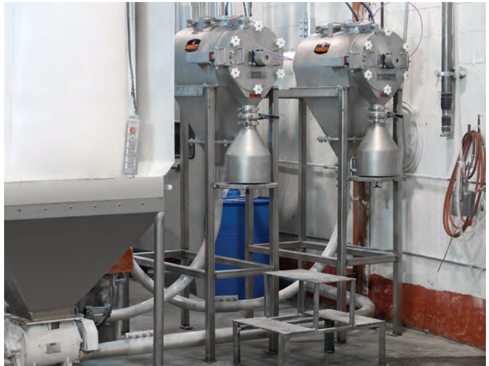
One pressurized CENTRI-SIFTER centrifugal sifter is dedicated to screening of white flour, the other for screening of whole wheat flour.

Flour entering the sifter's inlet is fed by a screw into a horizontally oriented cylindrical sifting chamber, where rotating helical paddles continuously propel material against the screen, accelerating the passage of on-size