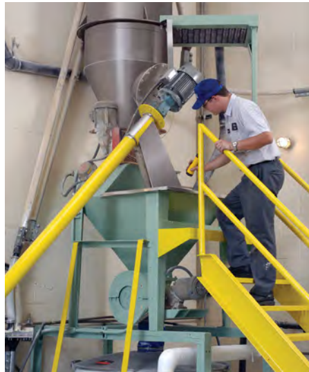
Operator checks flow of durum granular flour and recycled ground pasta into feed hopper, rotary airlock and 48 in. (122 cm) screener below.

vintage gyratory sifter.” The old sifter had been modified and repaired so many times that no clues remained as to its origins.