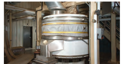
An 84 in. (2125 mm) diameter circular fluid bed dryer, clad with insulation blanket, dries almonds to moisture content between 4.5 and 5.5 percent. Throughput rate is 22,000 lb (9,979 kg/h) per hour.

guaranteed those results if we could supply the minimum temperatures for drying and maximum temperatures for cooling operations. We like small footprints and vertical systems around here, so after the testing and one customer recommendation, we ordered the two circular vibratory fluid bed units. They were easy to install, easy to operate and clean, and they’re working efficiently as guaranteed.”