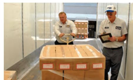
Dried pasta and other food products are shipped worldwide for hunger relief.

The Church of Jesus Christ of Latter Day Saints seeks to abate suffering everywhere, among any people. Relief efforts include feeding the hungry worldwide, and the operation of its own food production and processing plants has enabled the Church to expand emergency response for famine victims and disasters such as the tsunami in Southeast Asia and Hurricanes Katrina and Rita on the U.S. Gulf Coast.