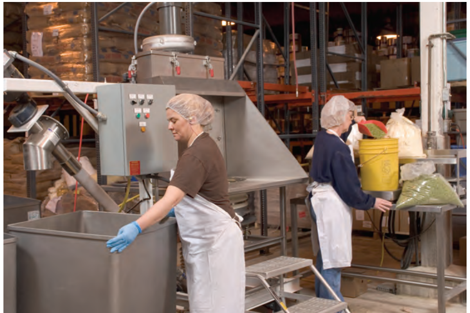
Mobile bins of screened material are wheeled to the processing side of the plant.

clumps and foreign material discharge through an “overs” discharge spout at the screen’s periphery, while on-size particles ( \leq 5.66 mm) gravity discharge at a rate of 50 lb/min (23 kg/min) into a flexible screw conveyor that is 6 in. (152.4 mm) in diameter, 6 ft (1.8 m) long and inclined at 45-degrees. Screened material is conveyed into mobile bins that are wheeled to the “processing” side of the plant for blending with proteins and cooking.