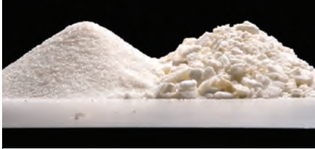
The facility's VIBROSCREEN screeners separate sugar lumps (right) from grains

The New York, Susquehanna and Western Railway (NYSW) transports a variety of commodities to its bulk transfer facilities located in the heart of the metropolitan New York market and in upstate New York. One of these NYSW units is Susquehanna Bulk Systems , a food-grade bulk-transfer