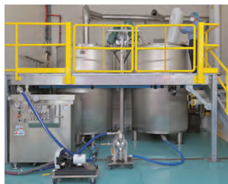
Slurry from the batching tank (R) is pumped to the feed tank (L) where it is metered into the spray dryer.

“All the action happens in the vicinity of the atomizer, whether it is a centrifugal wheel or a nozzle,” Kimmick continues. “Selecting the proper equipment and determining the optimum settings and adjustments are the keys to successful spray drying. For example, various sizes and