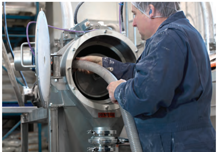
Quick cleaning: Operator opens end plate, removes basket, and cleans basket and sifter interior in 10 minutes.