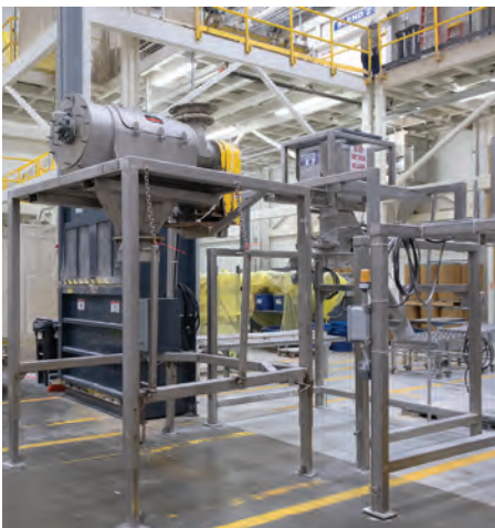
CENTRI-SIFTER centrifugal sifters screen ingredients to meet particle size requirements and maintain product quality. At right, 50 lb (23 kg) bags of ingredients await sifting.