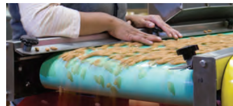
Almonds are hand sorted before entering the pasteurizer.