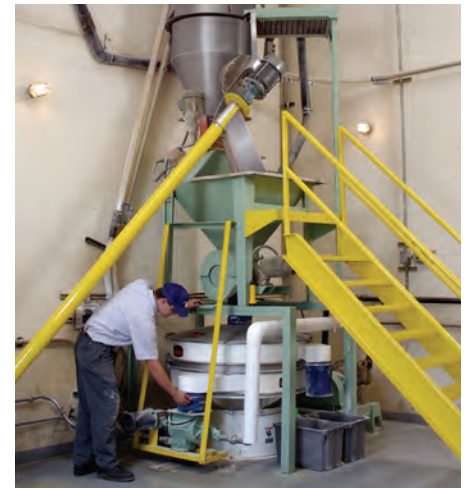
A 48 in. (122 cm) circular vibratory screener replaced a vintage gyratory sifter, decreasing waste and saving time and labor in re-screening rejected material.

Regrind is mechanically conveyed via a 4 in. (10.2 cm) diameter auger conveyor to the feed hopper. The mixture is then metered through a rotary airlock valve into the vibratory sifter at a rate of 1,800-2,000 lb/hr (816-907 kg/hr) on a continuous basis.