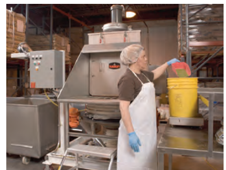
An operator weighs the amount of ingredient to be screened.