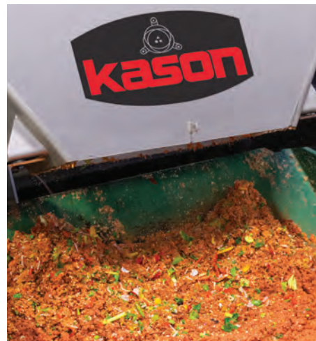
TGD Cuts' organic waste is utilized by a local farmer as animal feed.

In addition to easing the burden on Howard County's WTP, removing total suspended solids from the waste stream produces a steady supply of hog feed which is picked-up daily by a local farmer.