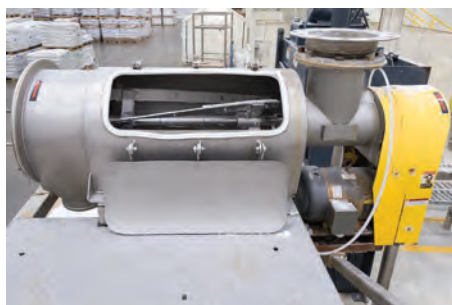
Rotating helical paddles create centrifugal force that accelerates on-size material through the screen, while propelling oversize particles through the downstream end of the screen cylinder. Nylon brushes affixed to the paddles prevent screen blinding.

"A lot of the material passing through the screens can be clumpy. In a regular screener, material would build up, blind the screen, and slow our throughput, but the self-cleaning nylon brushes on the rotating paddles keep the screen clear of buildup," says Williams.