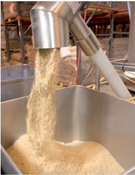
Screened dry ingredients are conveyed into a mobile bin that is wheeled to the processing side of the plant