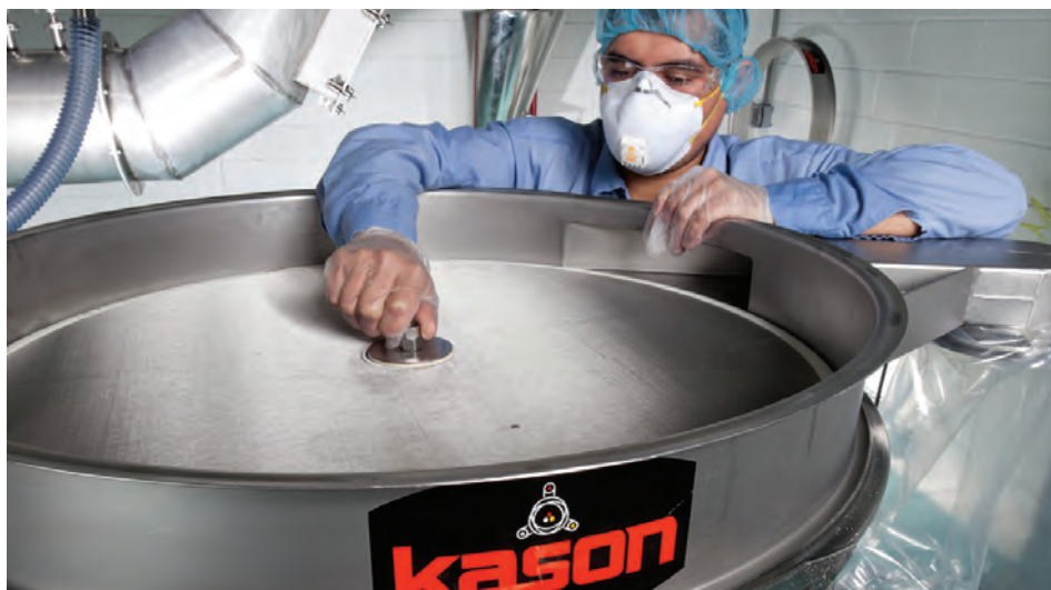
A Kason vibratory screener with circular 80 mesh (178 µm, 0.0070 in.) screen is inspected between production batches of fragrance powders.

The screener's 30 in. (76.2 cm) diameter screens are interchangeable, and range from 20 mesh (864 µm, 0.034 in.) to 60 mesh (234 µm, 0.0092 in.). “We're currently testing an application that would require use of a 200 mesh (74 µm, 0.0029 in.) screen, and Kason is helping us explore several techniques for prevention of screen blinding,” he says.