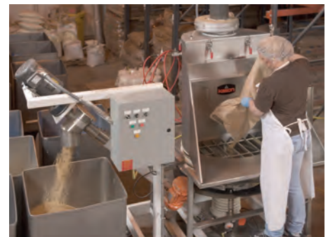
Mobile 30 in. (762 mm) diameter vibratory bag dump screener sifts dry ingredients prior to mixing them with meat protein. The waist-high unit minimizes physical effort in bag dumping, and includes a built-in dust collector.

A worker now dumps a full bag of dry ingredients onto the screen that, at half the height of Freshpet’s homemade screener, reduces physical effort, while the dust-containment system improves safety and plant hygiene. The screener employs two imbalanced-weight gyratory motors, mounted externally on opposite sides of the screener, to impart multi-plane inertial vibration that maximizes the rate at which particles pass through or across the screen surface. Material