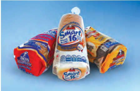
Flour is screened at 30 mesh (600 micron) and 8 mesh (2360 micron) sizes for Canada Bread Atlantic's main products - white and whole wheat breads, and 'Smart Bread' multigrain bread based on white whole wheat flour.

The St. John's, Newfoundland, plant of Canada Bread Atlantic , one of Canada's largest producers of bread and other flour-based products, processes more than 30,000 tons (30,500 tonnes) of flour annually, requiring an efficient, low-maintenance system to sift the flour upstream of blending and baking operations.