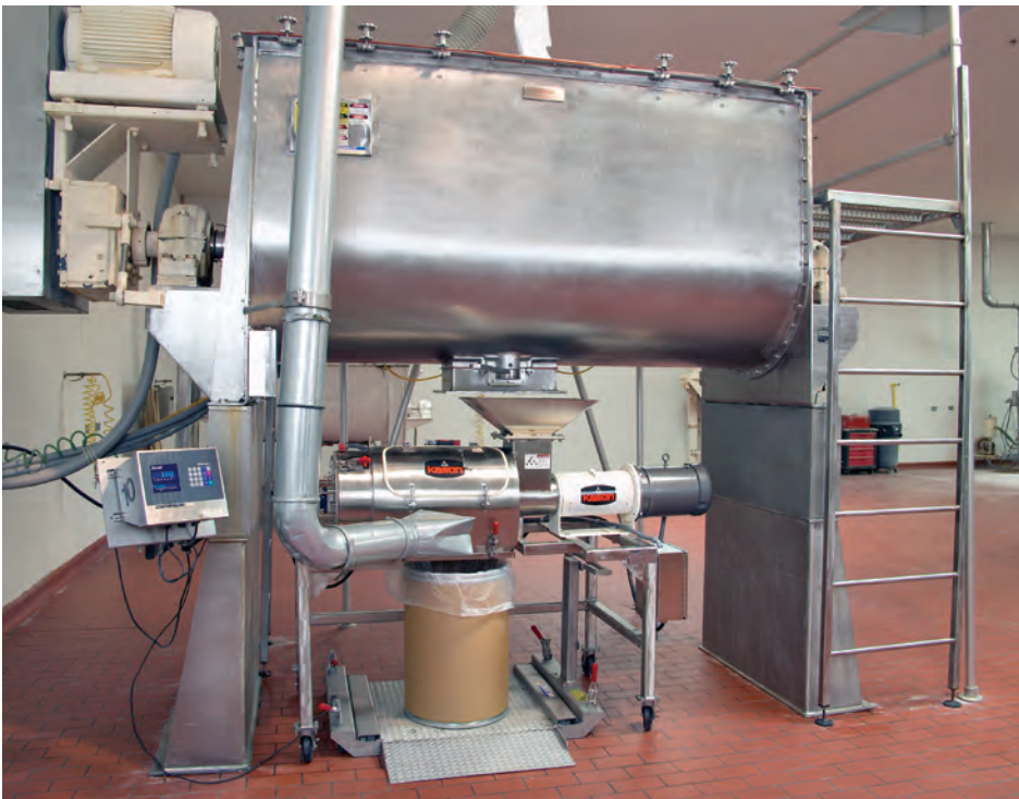
A Quick-Clean CENTRI-SIFTER centrifugal screener fits the restricted space below an 80 cu-ft (2.2 cu-m) capacity blender, sifting flavor powders at high rates.

Frequent product changeovers necessitate a minimum of one wash down per shift, a task that incurs minimal downtime, owing to the screener's three-bearing design. The shaft cantilevers on a bearing located between the motor end of the shaft and the material feed screw when the hinged end cover is open, allowing the