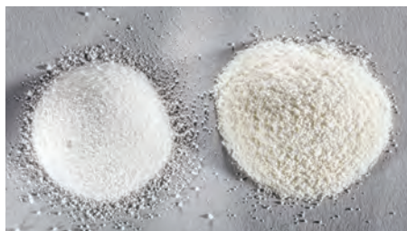
Material before (left) and after being moisturized, agglomerated and dried in the circular fluid bed processor.

Precision Blending International's (PBI) business consisted entirely of blending and milling dairy powders for food and dairy products until 2010, when a customer asked the company to produce an agglomerated blend of finely powdered raw material to improve its processability in food formulations.