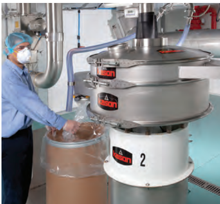
Downstream of the spray dryer, a Kason screener removes oversize particles. Because of the company's expertise in spray drying, "overs" (spout at right) comprise a small percentage of the total batch.

Once the materials have been separated and dried in the spray dryer, they are conveyed to a rotary airlock. The particles pass through a rare earth magnet and are then fed into a Kason VIBROSCREEN circular vibratory screener to remove agglomerates, flakes, lumps and any sheets or layers that may have formed on the side walls of the spray dryer. The screening chamber is suspended on rugged springs that allow it to vibrate freely while minimizing power consumption and preventing transmission of vibration to the floor. One imbalanced-weight gyratory motor creates multi-plane inertial vibration to the screen deck, controlling the flow path of material on the screen surface and maximizing the rate at which material passes through the screen. The on-size material exits through a discharge spout located at the screen's periphery. Particles smaller than the screen apertures pass through and exit through a lower discharge spout that feeds the packaging machinery.