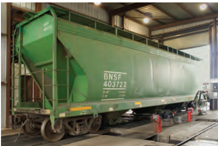
SBS Sparta receives dry-bulk granular sugars in covered hopper railcars.