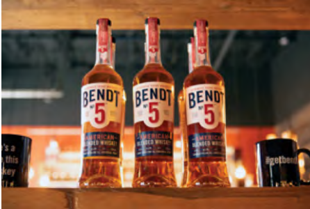
Bendt Distillery produces 'premium hand-crafted spirits that stay true to traditional distilling'.

Bendt Distilling Company , a maker of handcrafted whiskeys, uses a centrifugal sifter to turn spent grain byproduct into saleable livestock feed, while recovering the liquid sour mash, a valuable component in the distilling process.