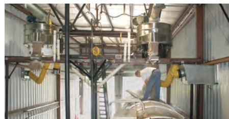
Two 60 in. (1524 mm) diameter Kason VIBROSCREEN screeners are used to load trucks with sugar at the SBS Sparta facility.