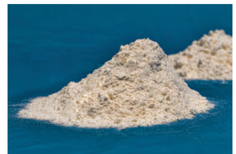
Screened flour ready for blending with other ingredients.

The material is metered by rotary valve into a pneumatic conveying line, and is directed through a diverter valve into either of two model MO-PS-SS CENTRI-SIFTER centrifugal sifters. One is fitted with a 30 mesh (600 micron) screen for white flour and the other with an 8 mesh (2360 micron) screen for whole wheat and "smart flour," a white whole wheat