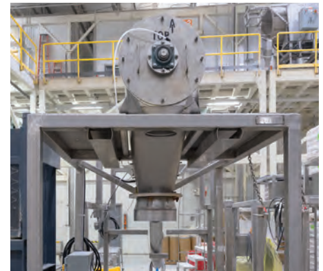
Centrifugal sifting maintains high throughput and product integrity at PacMoore's Mooresville, IN plant. Screened product gravity-discharges through a central chute.

“Final centrifugal sifting guarantees the product coming out of the blender is at the right classification. This granule size is very specific and typically requested by the customer,” Ramirez explains.