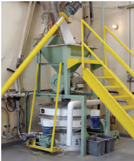
A 48 in. (122 cm) circular vibratory screener sifts up to 2,000lb/hr (907kg/hr) of durum granular flour. Auger conveyor transports a small amount of recycled, ground pasta to the feed hopper.

The Church of Jesus Christ of Latter-Day Saints established the Deseret Pasta Plant in the 1960s to produce dried pasta for relief and humanitarian efforts. The plant increased production capacity with the purchase of used processing equipment in 1975. Over the years antiquated equipment has gradually been replaced, beginning with two new Buhler presses and dryers in 1980.