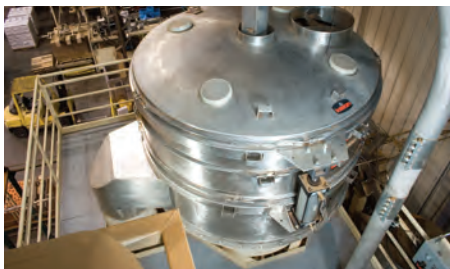
An 84 in. (2125 mm) diameter circular fluid bed cooler reduces the temperature of almonds with air cooled to 65°F (18.3°C) or less in one minute.

Heated almonds exit through a discharge spout at the periphery of the fluid bed dryer and are elevated 35 ft (10.7 m) by a drag conveyor to a Kason circular vibratory fluid bed cooler which differs from the dryer in only one respect: instead of a thermal fluid heater with blower to introduce warm air, it is equipped with a heat exchanger (plumbed to a plant chiller) and blower to force cool (65°F [18.3°C] maximum) air into the center of the fluid bed chamber from below,