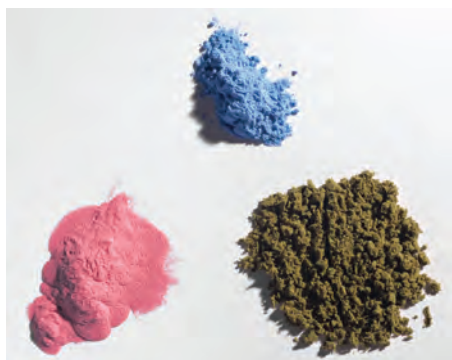
Repose piles show cranberry powder, copper solution for vitamins and chlorophyll powder—several of the powders produced by Summit Custom Spray Drying.