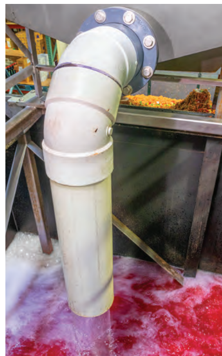
Screened wastewater is pumped to the municipal wastewater plant in compliance with accepted levels of total suspended solids.