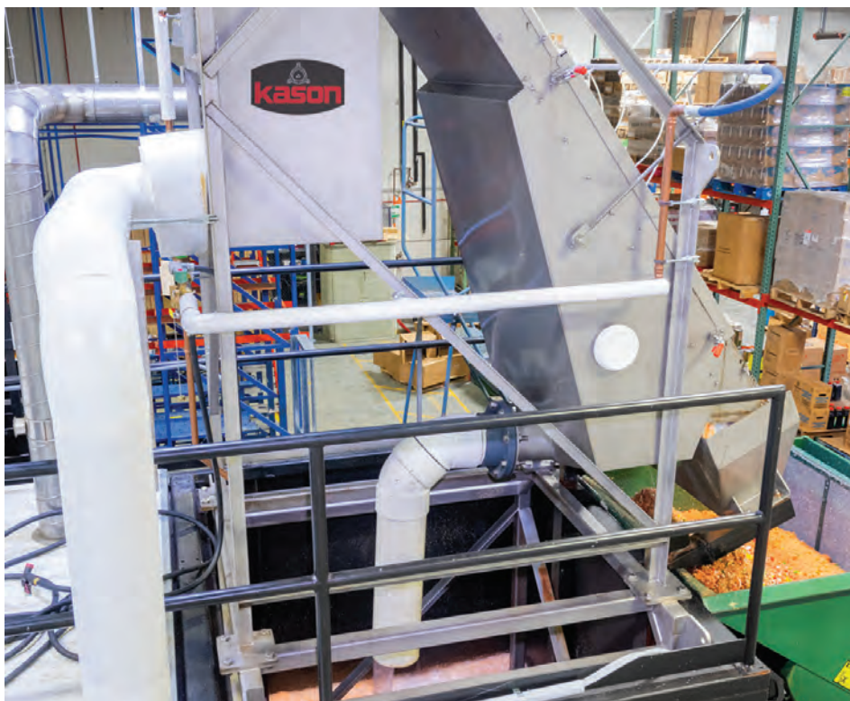
Wastewater is pumped onto the dewatering sieve which separates solids at high rates without the use of power.