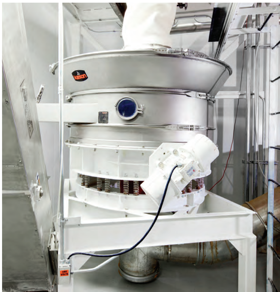
Powder enters the circular fluid bed processor through the top port. From the bottom, hot air is continuously blown upward through an enclosed circular screen on which the particles separate and fluidize. At timed intervals, liquids are added to the air stream to moisturize and agglomerate the particles, while the hot air continues to dry the material.