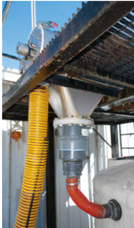
Oversized grain solids exit through downspouting into an enclosed container. Recovered liquid (sour mash) gravity feeds through the center discharge, is stored and added to subsequent fermentation batches.

In researching a solution, DeHart read about another distillery's use of a centrifugal sifter to dewater stillage. He contacted the manufacturer, who evaluated Bendt's application and recommended a Kason model MO-3BRG.