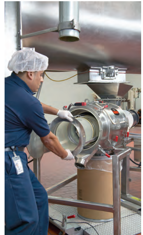
The three-bearing cantilevered shaft of the Quick Clean CENTRI-SIFTER screener enables the operator to open a hinged end cover and remove the screen cylinder and paddle assembly for rapid screen changes and cleaning during frequent product changeovers.

Flavorchem is a full service flavor company offering finished flavor products as well as R&D to confectionery, bakery, dairy, beverage, and other markets.