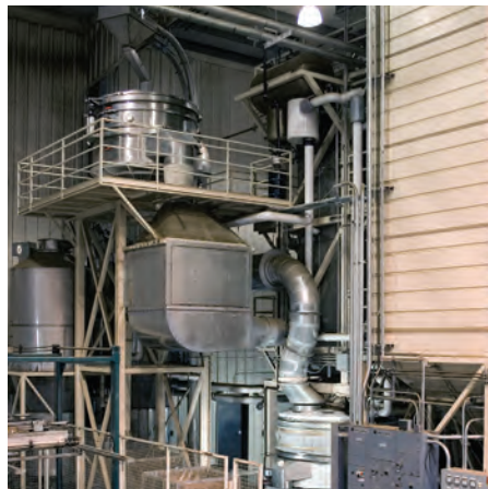
Almonds are conveyed from a holding tank (right) to a pasteurization tower (left of holding tank) from which they proceed to a fluid bed dryer (bottom) and then to a fluid bed cooler (top). Beneath the cooler is an equilibration tank where almonds achieve uniform temperature.

According to Jahn, a fluid bed processor had not previously been used for drying or cooling of almonds, so he specified the heat and moisture ranges required immediately after pasteurization, the cooling requirements after drying, the throughput requirement of 22,000 lbs/h (9,979 kg/h) of almonds, and other requirements. He then shipped raw almonds to the Kason laboratory in Millburn, NJ for both drying and cooling trials.