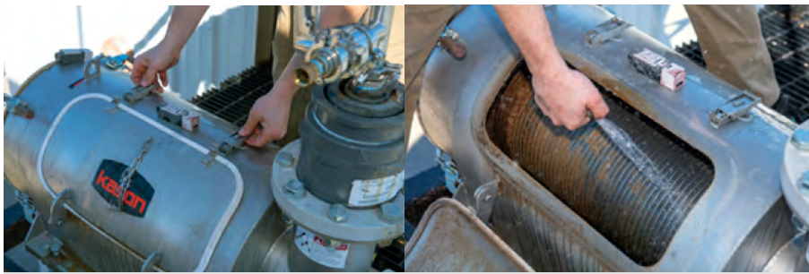
The sifter cleans easily as the front access door (left) opens for internal components to slide from a cantilevered shaft. The top access port permits quick rinse of the screen.