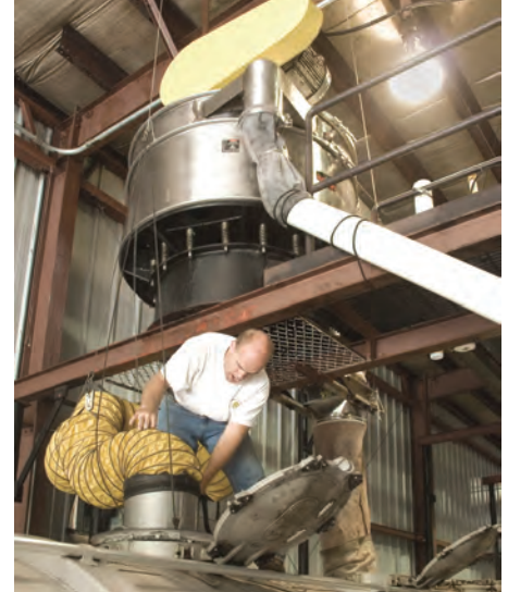
Each of the high-capacity discharge VIBROSCREEN units can screen up to 36 tons/hr, allowing trucks to be rapidly loaded with sugar.

To remove lumps from granular sugar, the overhead auger feeds the material into a 60 in. (1524 mm) diameter, 3 mesh, VIBROSCREEN circular vibratory screener from Kason Corp. An unbalanced-weight gyratory motor mounted directly beneath the screening chamber produces both vertical and horizontal vibration of the device's spring-mounted screening deck. The vertical vibration causes sugar particles to pass through apertures in the screen at high rates, while the horizontal vibration moves sugar lumps across the screen in controlled pathways until they exit through a spout at the periphery of the screen and drop into a tailings bin to be discarded.