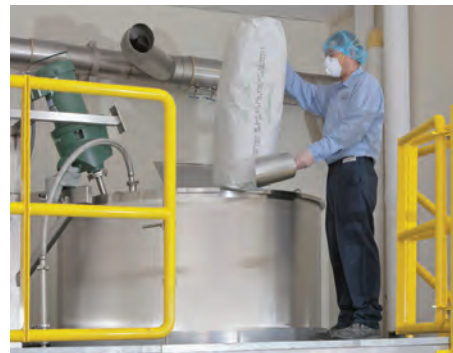
In the mixing room, an operator empties ingredients into the batching tank according to the customer's recipe.

it will either be pumped through a high-pressure homogenizer (up to 500 psi [35 kg sq cm]), or transferred to a homogenizer tank that has a fixed rotor-stator. The completed emulsion, solution or slurry is then transferred to a holding tank with continuous mixing. From there, a feed pump meters the solution or emulsion into the spray-drying chamber, where the solids and liquids are separated.”