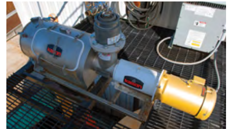
The CENTRI-SIFTER centrifugal sifter at the distillery runs at a higher voltage than normal in order to screen heavy, sludgy stillage.

The unit is 74 in. (1880 mm) long, including its motor, and 32 in. (813 mm) high. The stainless steel wedge wire screen is sized at 140 mesh (105 micron).