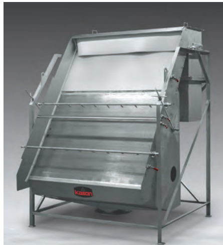
Instead of a free standing Cross-Flo sieve such as this one, M.H. Zeigler & Son uses one suspended from the ceiling.

After passing through the screens, the water flows to the sewer and is cleaned further by the public water authority. Leaves, twigs and any other debris are hauled out by trailer along with apple pulp and they are disposed of according to environmental regulations.