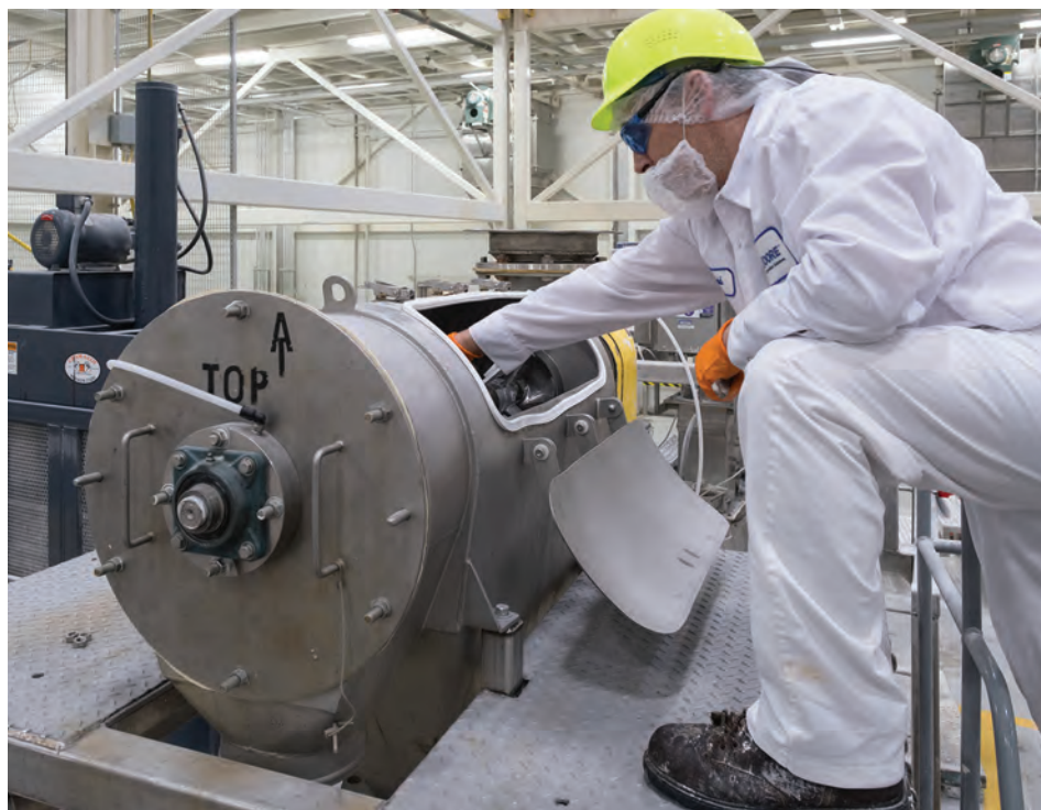
A hinged door with safety interlock provides interior access for cleaning, inspection and screen changes.

The screens last for years, reports Williams. "With other sifters we had screen breakage quite often, but have not had any with the centrifugal sifters."