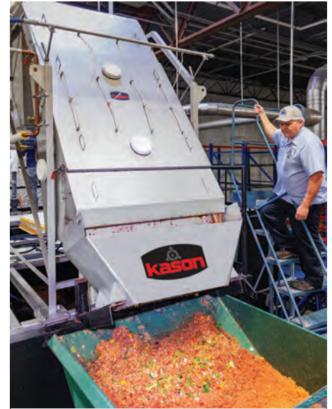
Wastewater flows over an inclined screening deck that captures peelings, stems, foreign objects and debris as small as seeds.

Important to TGD Cuts is that no motor or labor is required. “The liquid merely flows over and through the profile wire screen, as solids fall naturally from the screen into the hopper,” says Sainato.