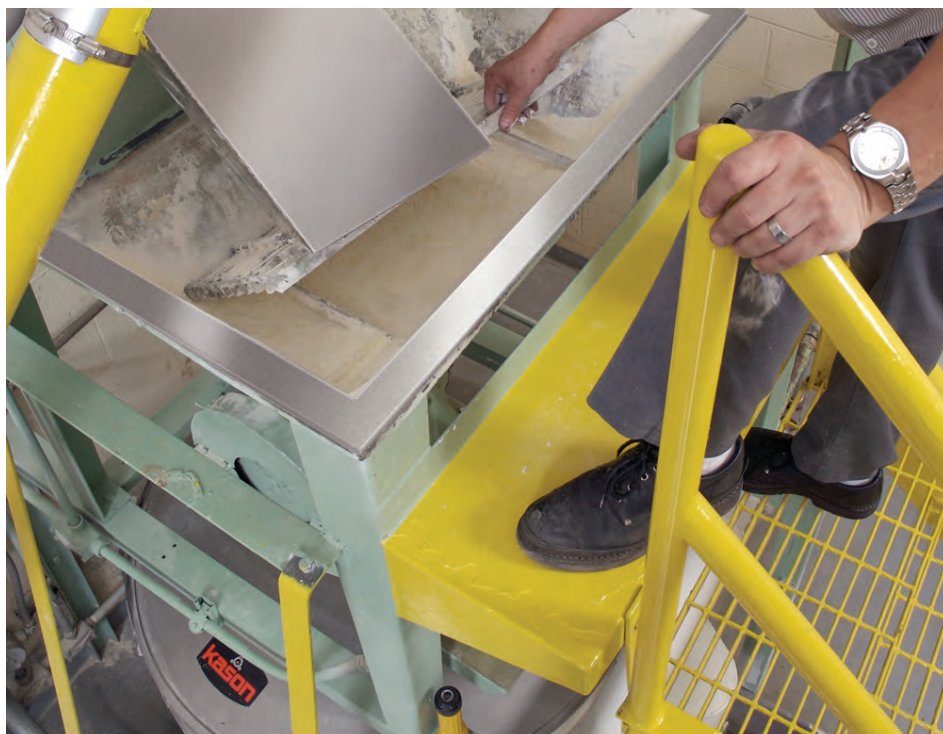
Operator checks flow of durum granular flour and recycled ground pasta into feed hopper, rotary airlock and 48 in. (122 cm) screener below.

make dough, extruded into pasta, cut to the proper size, and dried. Material screened from the feed exits the screener's discharge spout into a box and is manually recycled into the feed hopper.