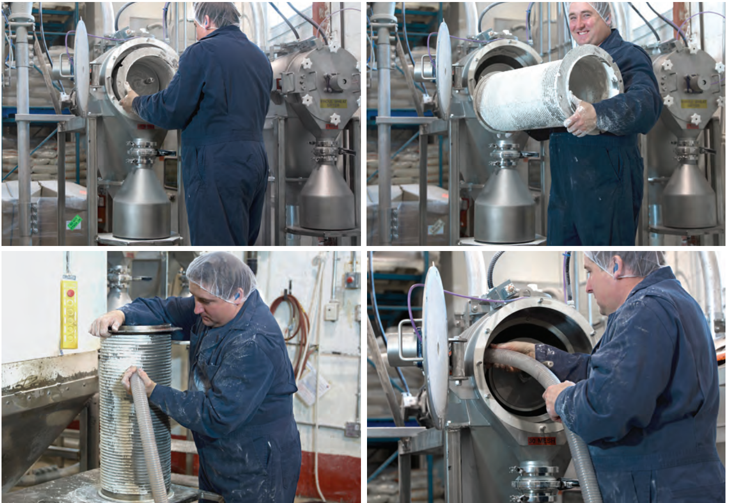
Quick cleaning: Operator opens end plate, removes basket, and cleans basket and sifter interior in 10 minutes.

“The sifters can handle more than 10,000 lb/h (4,500 kg/h) and will meet our capacity for years to come,” he says.