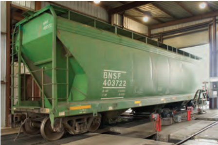
SBS Sparta receives dry-bulk granular sugars in covered hopper railcars.