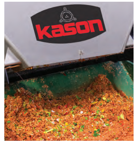
TGD Cuts' organic waste is utilized by a local farmer as animal feed.

In addition to easing the burden on Howard County's WTP, removing total suspended solids from the waste stream produces a steady supply of hog feed which is picked-up daily by a local farmer.