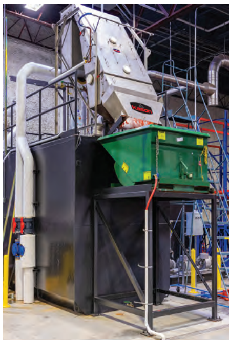
CROSS-FLO Sieve removes solids from 28,000 gal (106,000 l) per day of TGD Cuts’ wastewater before it enters the municipal wastewater system.

Manufactured by Kason Corporation, the sieve is a single-deck model measuring 48 in. (1219 mm) in width and 54 in. (1372 mm) in length. The incline of the screen deck can be field