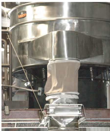
Rotation of the screener's motor produces both vertical and horizontal vibration of the screening deck. Vertical vibration causes sugar particles to pass through apertures in the screen at high rates. These particles exit the screener through a discharge spout. Horizontal vibration moves oversize particles to the periphery of the screener, where they exit the device through a chute.

After exiting the screener, sugar passes through a rare earth magnet, which removes any metal filings that might be in the material. The screener and magnet are critical control