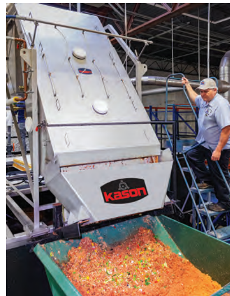
Wastewater flows over an inclined screening deck that captures peelings, stems, foreign objects and debris as small as seeds.

Important to TGD Cuts is that no motor or labor is required. “The liquid merely flows over and through the profile wire screen, as solids fall naturally from the screen into the hopper,” says Sainato.