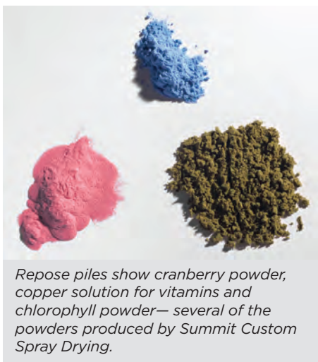
Repose piles show cranberry powder, copper solution for vitamins and chlorophyll powder— several of the powders produced by Summit Custom Spray Drying.