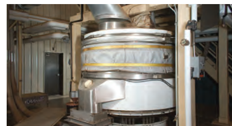
An 84 in. (2125 mm) diameter circular fluid bed dryer, clad with insulation blanket, dries almonds to moisture content between 4.5 and 5.5 percent. Throughput rate is 22,000 lb (9,979 kg/h) per hour.

guaranteed those results if we could supply the minimum temperatures for drying and maximum temperatures for cooling operations. We like small footprints and vertical systems around here, so after the testing and one customer recommendation, we ordered the two circular vibratory fluid bed units. They were easy to install, easy to operate and clean, and they’re working efficiently as guaranteed.”