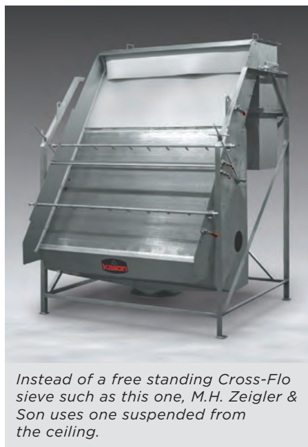
Instead of a free standing Cross-Flo sieve such as this one, M.H. Zeigler & Son uses one suspended from the ceiling.

After passing through the screens, the water flows to the sewer and is cleaned further by the public water authority. Leaves, twigs and any other debris are hauled out by trailer along with apple pulp and they are disposed of according to environmental regulations.