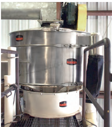
Overhead horizontal augers move sugar into the two VIBROSCREEN screeners in the facility. Each screener separates sugar lumps from grains by vibrating a single spring-mounted screening deck located in the upper part of the unit. The vibration is produced by rotation of an unbalanced-weight gyratory motor located below the screening chamber.