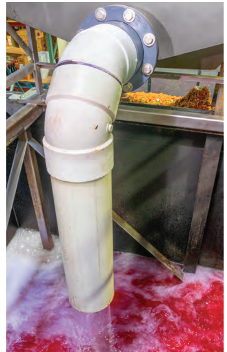
Screened wastewater is pumped to the municipal wastewater plant in compliance with accepted levels of total suspended solids.