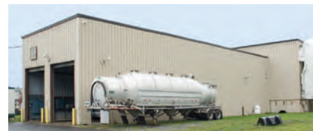
At the SBS Sparta facility, sugar is transferred from railcars to bulk trailers that carry the materials to their final destinations.