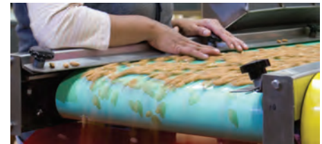
Almonds are hand sorted before entering the pasteurizer.