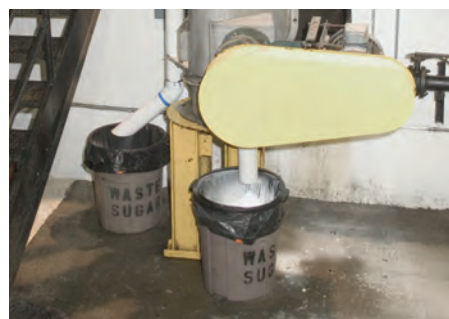
Oversize material falls through a 4 in. (102 mm) diameter chute and drops into a tailings bin.

The truck rests on a scale under the screener, which sits on two steel beams about 15 ft (4.5 m) above the floor of the enclosed loading bay. On-size material ejected through the screener's bottom discharge port, passes through the magnet below the port, and drops into the truck. Oversize material exiting the screener's upper discharge port passes through a 4 in. (102 mm) diameter chute, and drops into the tailings bin.