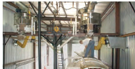
Two 60 in. (1524 mm) diameter Kason VIBROSCREEN screeners are used to load trucks with sugar at the SBS Sparta facility.

To remove lumps from granular sugar, the overhead auger feeds the material into a 60 in. (1524 mm) diameter, 3 mesh, VIBROSCREEN circular vibratory screener from Kason Corp. An unbalanced-weight gyratory motor mounted directly beneath the screening chamber produces both vertical and horizontal vibration of the device's spring-mounted screening deck. The vertical vibration causes sugar particles to pass through apertures in the screen at high rates, while the horizontal vibration moves sugar lumps across the screen in controlled pathways until they exit through a spout at the periphery of the screen and drop into a tailings bin to be discarded.