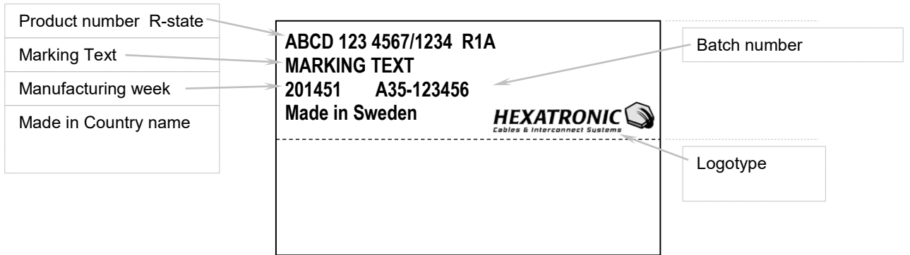
Figure 5. Label for cable assembly. Size: 86x22mm alt. 36x76mm (LZF 083 278/n).

CE – marking and WEEE – marking must be applied on labels for products that are covered by those standards.