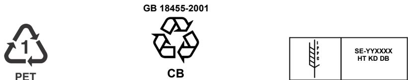
Figure 2. Plastic symbol Figure 3. Recycling symbol Figure 4. General ISPM15

When ESD bag is used, relevant ESD symbol must be marked on the bag.