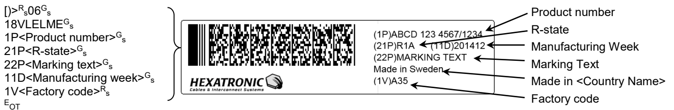
Figure 6. Label for ODF units, closures, cabinets, tools etc. Size: 43x10mm (LZF 083 204/3).