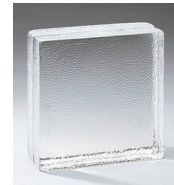
Laminated VISTABRIK® STIPPLED