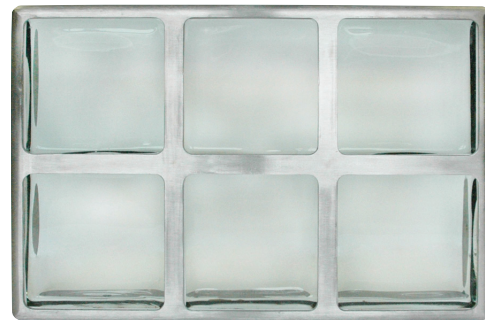
Steel frame with 8" x 8" Laminated VISTABRIK® Solid Glass Block.

Seves Glass Block Inc. has a sales and technical support team that is ready to help you design, engineer and specify glass block solutions. Please visit our website.