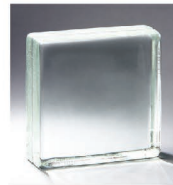
Laminated VISTABRIK ® CLEAR