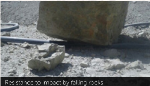
Resistance to impact by falling rocks

Designed and manufactured for a minimum lifetime of 50 years.