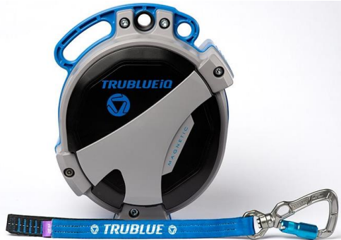
Model TBIQ-XL (20m lanyard, various connectors)