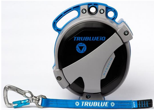
Model TBIQ-LT (12.5m lanyard, various connectors)